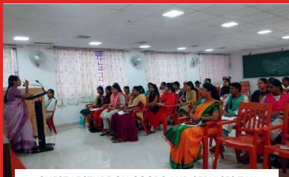
GUEST LECTURE ON GOODS AND SERVICES TAX