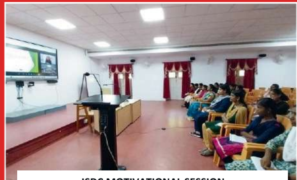
ISDC MOTIVATIONAL SESSION