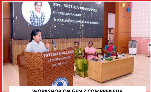
WORKSHOP ON GEN Z COMPRENEUR