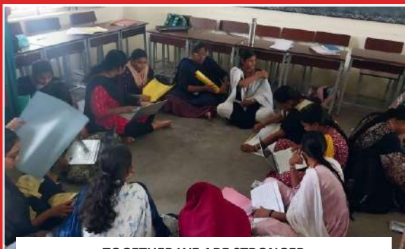
TOGETHER WE ARE STRONGER