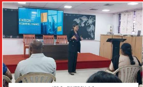
ISDC - FINTECH 4.0