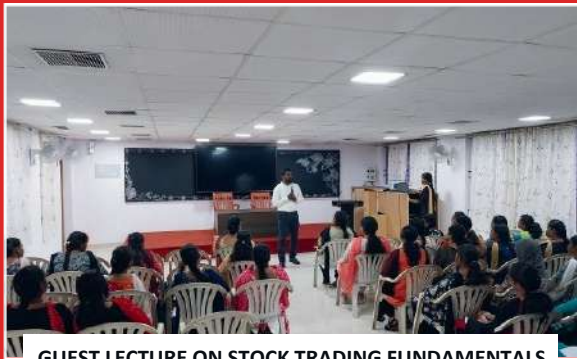
GUEST LECTURE ON STOCK TRADING FUNDAMENTALS