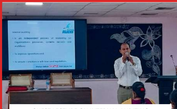
GUEST LECTURE ON INTERNAL AUDITING