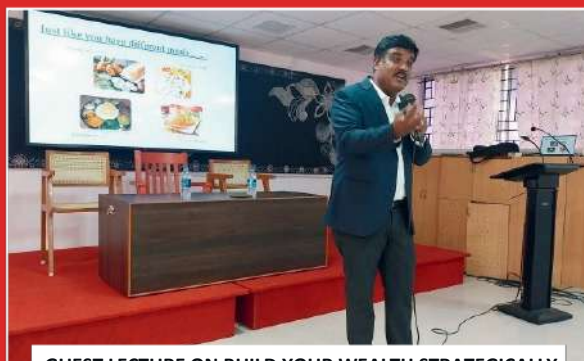
GUEST LECTURE ON BUILD YOUR WEALTH STRATEGICALLY