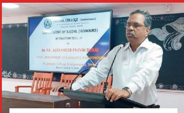
GUEST LECTURE ON ACCA ACCOMPLISHMENT