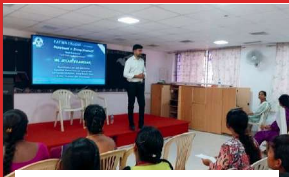
GUEST LECTURE ON SOFT SKILLS FOR PROFESSIONALS

Review of our journey – Growth, Learning and Laughter: