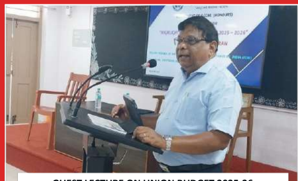
GUEST LECTURE ON UNION BUDGET 2025-26