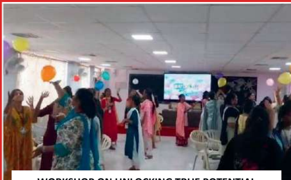
WORKSHOP ON UNLOCKING TRUE POTENTIAL