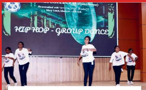
FEEL THE BEAT