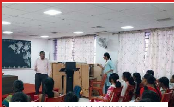
ACCA - NAVIGATING SUCCESS TOGETHER