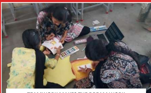
TEAMWORK MAKES THE DREAM WORK