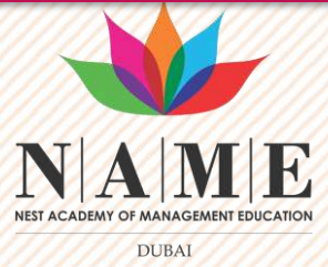
NEST ACADEMY OF MANAGEMENT EDUCATION, DUBAI