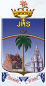
ST. JOSEPH'S COLLEGE, TIRUCHIRAPPALLI