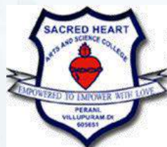
SACRED HEART ARTS AND SCIENCE COLLEGE, PERANI