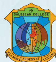
SALESIAN COLLEGE, SONADA & SILIGURI