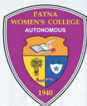
PATNA WOMEN'S COLLEGE (AUTONOMOUS), PATNA UNIVERSITY