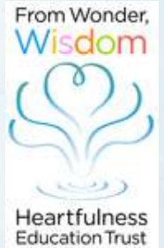
HEARTFULNESS EDUCATION TRUST, MADURAI