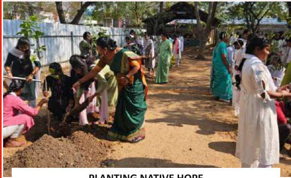
PLANTING NATIVE HOPE