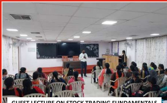
GUEST LECTURE ON STOCK TRADING FUNDAMENTALS