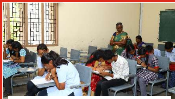
MIND MAZE (QUIZ)