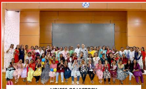
VOICES OF VICTORY