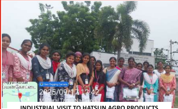
INDUSTRIAL VISIT TO HATSUN AGRO PRODUCTS