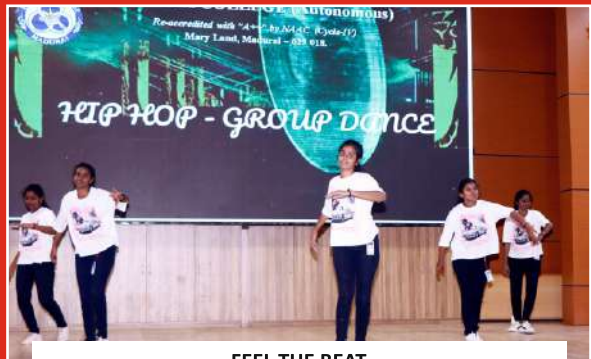
FEEL THE BEAT