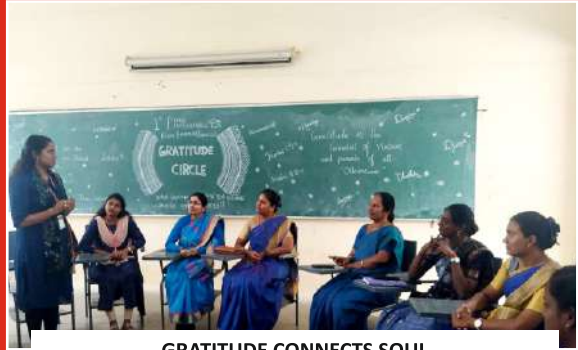
GRATITUDE CONNECTS SOUL