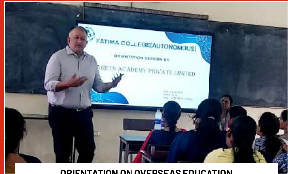
ORIENTATION ON OVERSEAS EDUCATION