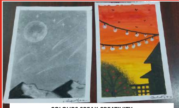
COLOURS SPEAK CREATIVITY