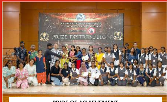
PRIDE OF ACHIEVEMENT