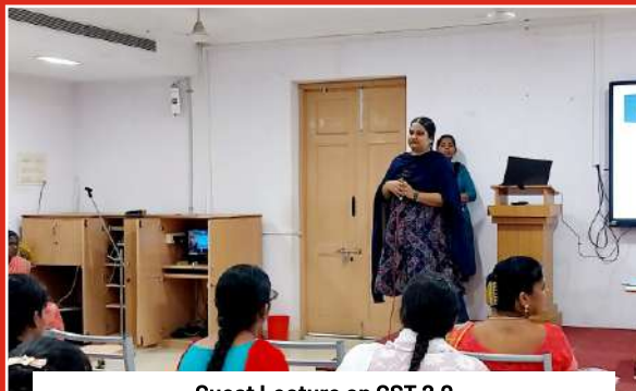
Guest Lecture on GST 2.0