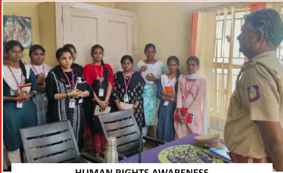
HUMAN RIGHTS AWARENESS