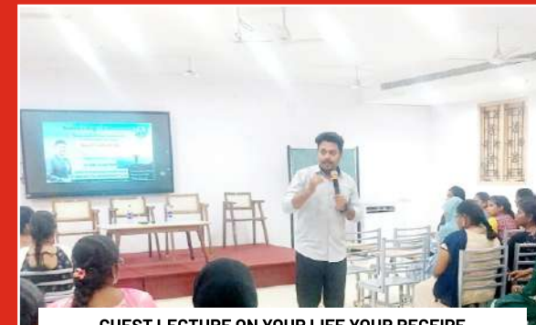
GUEST LECTURE ON YOUR LIFE YOUR RECEIPE