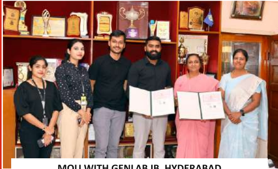
MOU WITH GENLAB IB, HYDERABAD