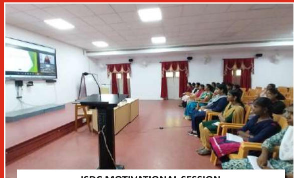
ISDC MOTIVATIONAL SESSION