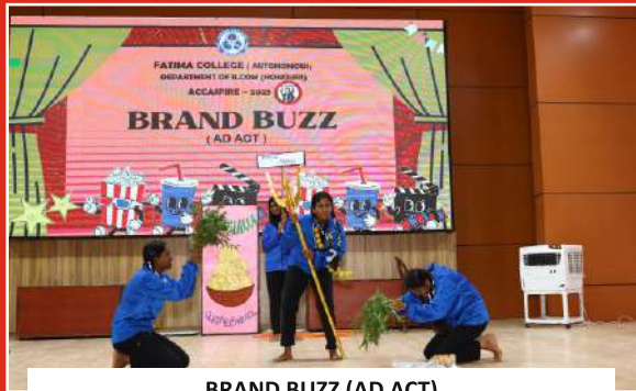
BRAND BUZZ (AD ACT)