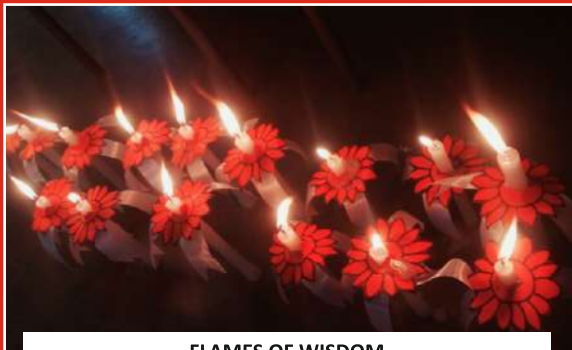
FLAMES OF WISDOM