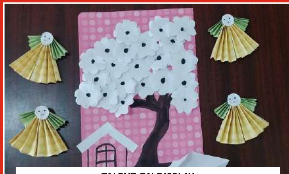
TALENT ON DISPLAY