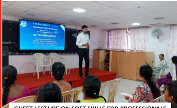
GUEST LECTURE ON SOFT SKILLS FOR PROFESSIONALS

Review of our journey – Growth, Learning and Laughter: