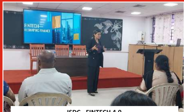
ISDC - FINTECH 4.0