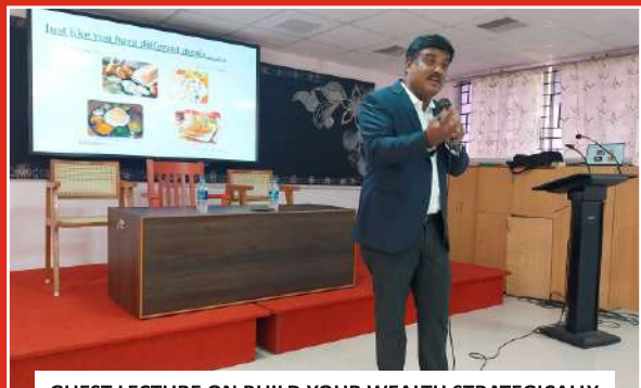
GUEST LECTURE ON BUILD YOUR WEALTH STRATEGICALLY