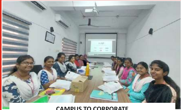
CAMPUS TO CORPORATE