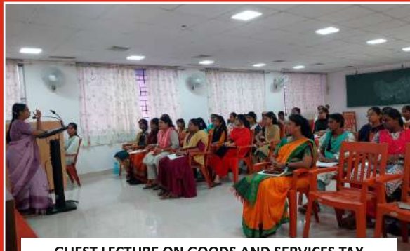
GUEST LECTURE ON GOODS AND SERVICES TAX