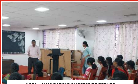
ACCA - NAVIGATING SUCCESS TOGETHER