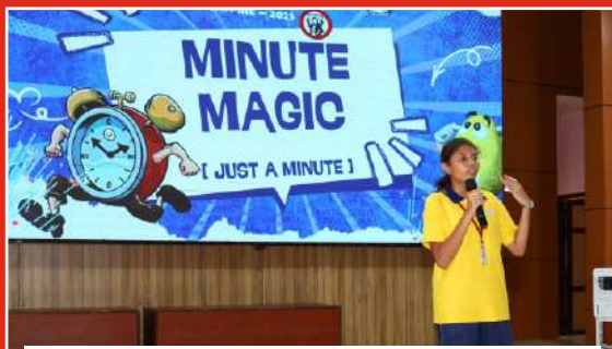
MINUTE MAGIC (JUST A MINUTE)