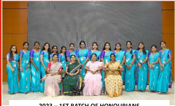
2023 – 1ST BATCH OF HONOURIANS