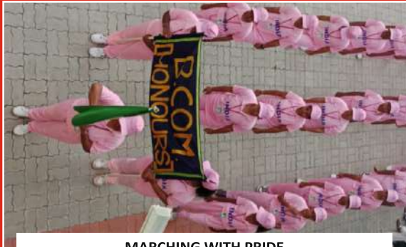
MARCHING WITH PRIDE