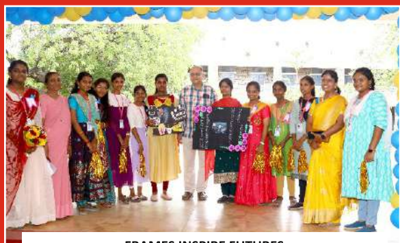
FRAMES INSPIRE FUTURES