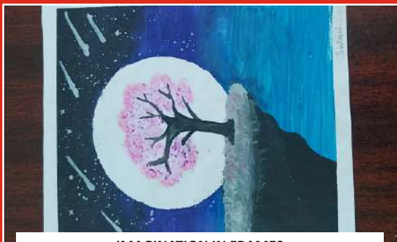
IMAGINATION IN FRAMES