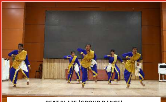
BEAT BLAZE (GROUP DANCE)