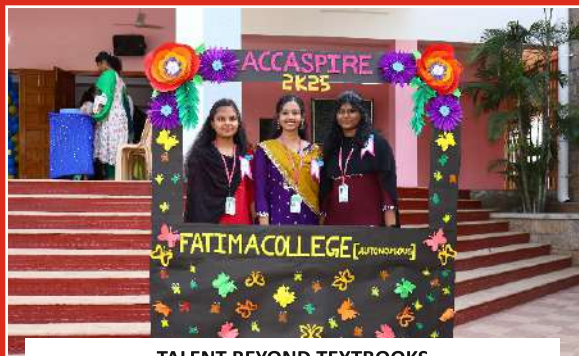
TALENT BEYOND TEXTBOOKS