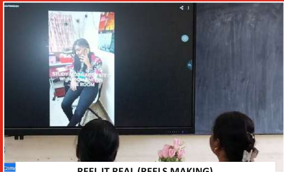
REEL IT REAL (REELS MAKING)