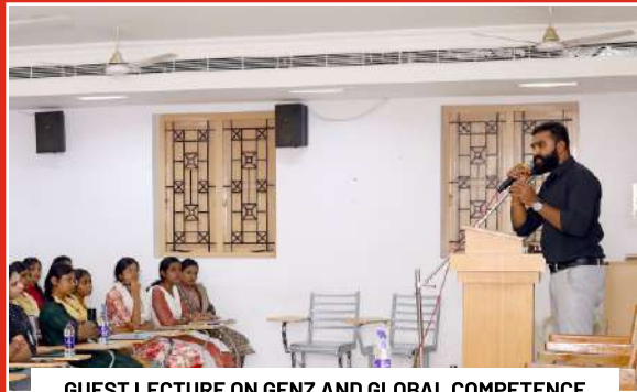
GUEST LECTURE ON GENZ AND GLOBAL COMPETENCE