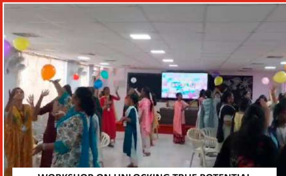
WORKSHOP ON UNLOCKING TRUE POTENTIAL