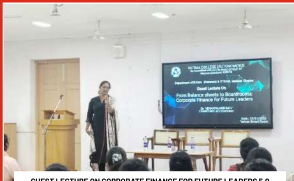
GUEST LECTURE ON CORPORATE FINANCE FOR FUTURE LEADERS 5.0