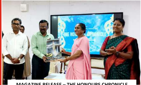
MAGAZINE RELEASE – THE HONOURS CHRONICLE