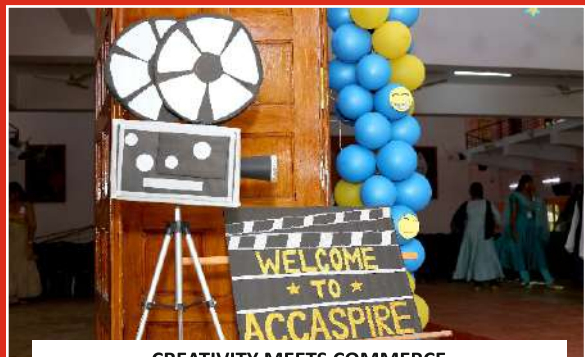
CREATIVITY MEETS COMMERCE