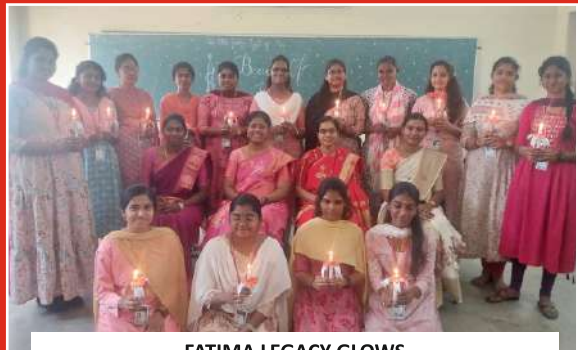
FATIMA LEGACY GLOWS