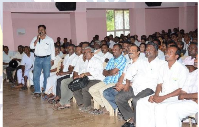
Parent-Teacher Meet for I UG and I PG students