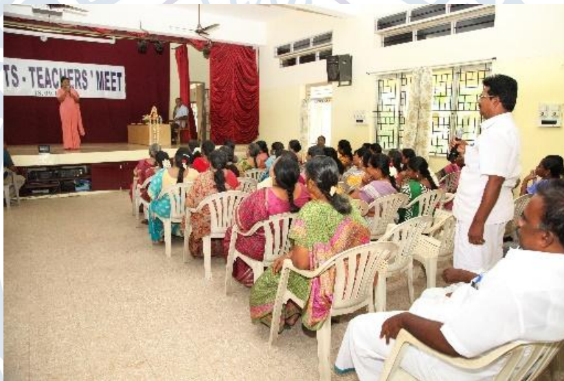
Parent-Teacher Meet for the students of I Year Professional Courses and PG IT