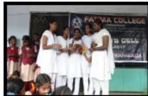
Songs on the importance of cleanliness