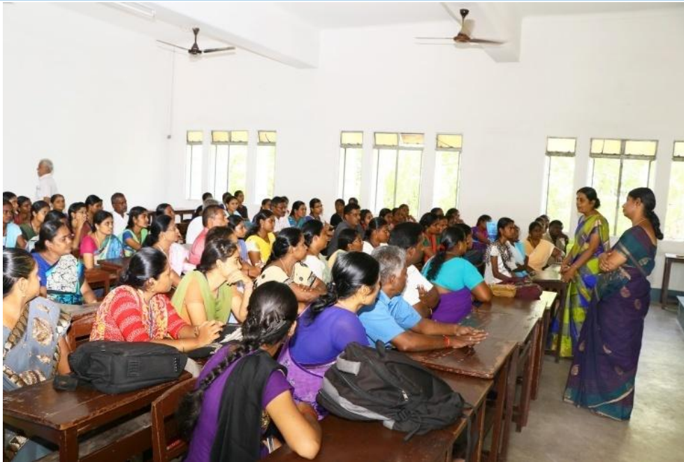
Parents meet the teachers in the departments concerned