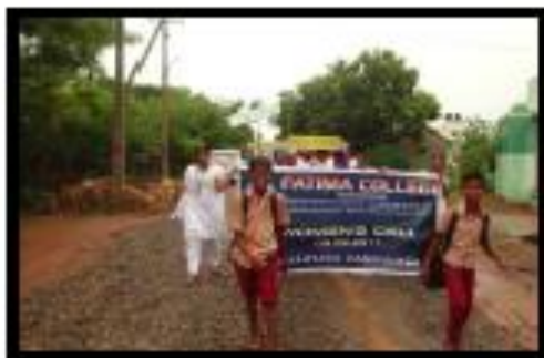
On a Rally