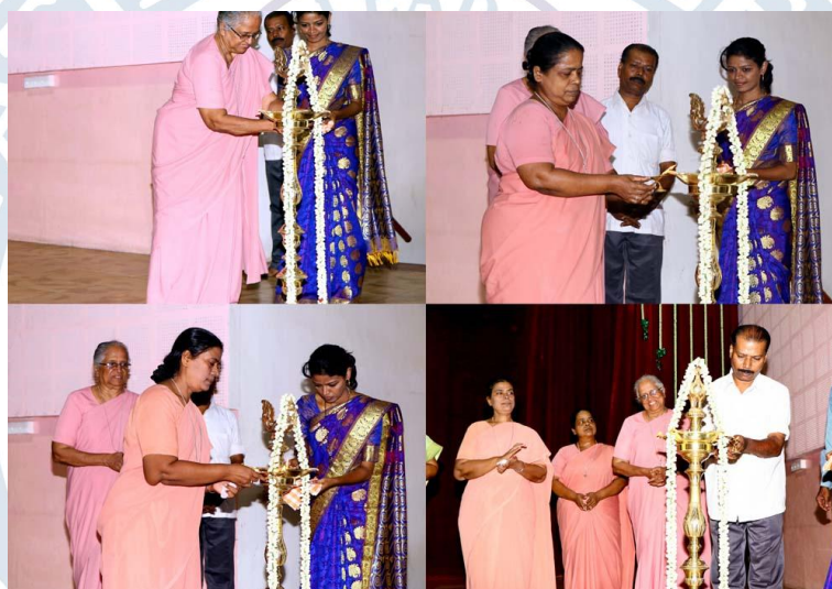
Dignitaries light the lamp