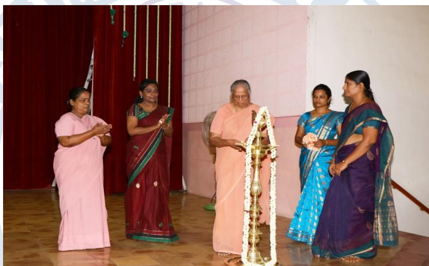
Dignitaries Lighting the Lamp