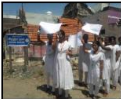
Rally in Indra Nagar by B. Sc. (IT)