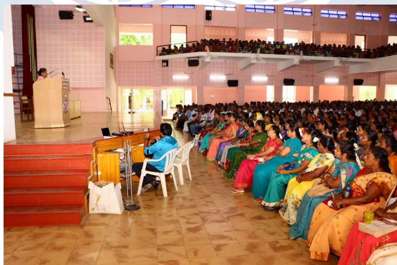
Principal enumerating the objectives of Parent Teachers' Meet