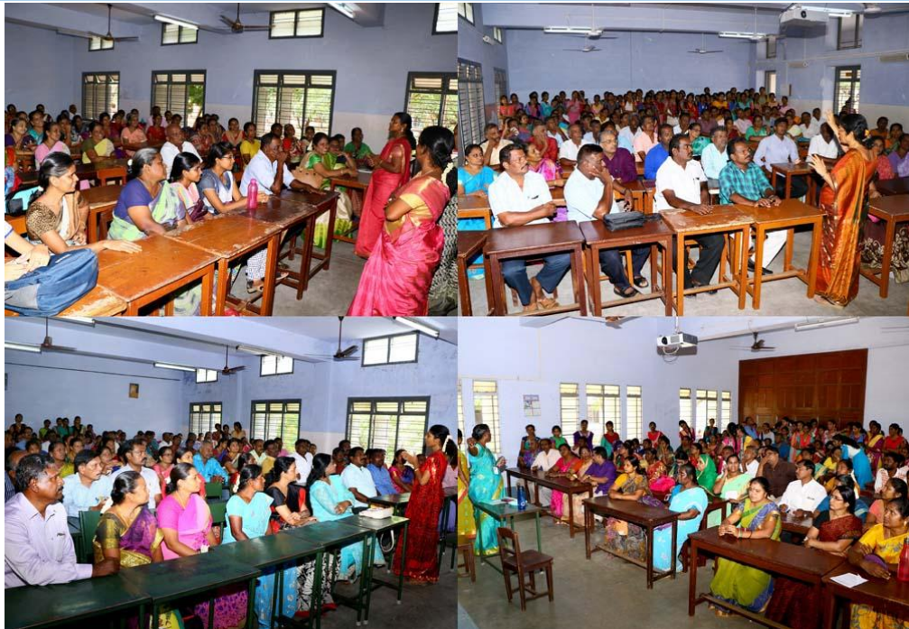
Parent Teachers' Meet in the departments concerned