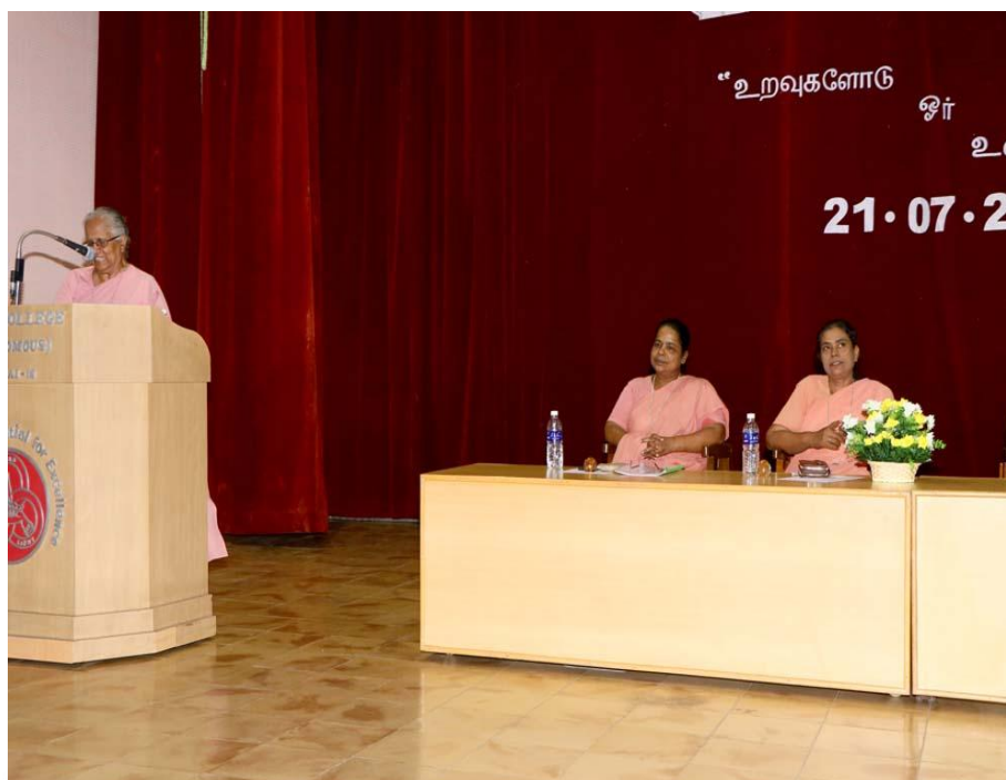
Secretary addressing the Parents