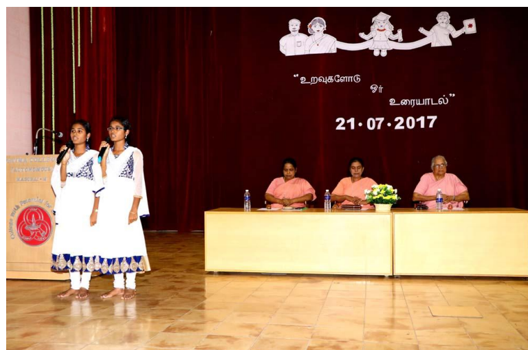
Seeking Divine Blessings