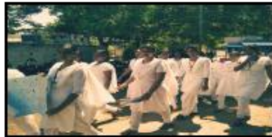
Rally by Maths (S.F) Eng