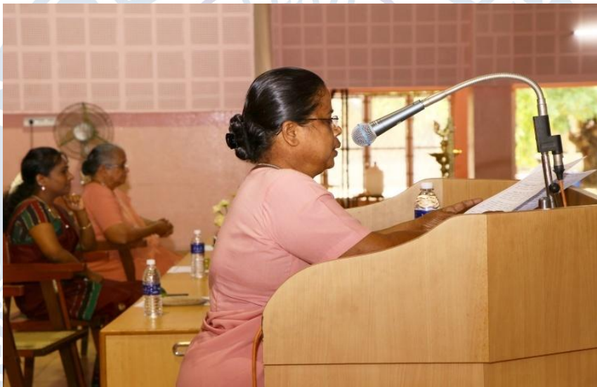
Principal Enumerating the Objectives of the Meeting