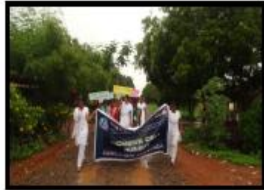
Speech on Cleanliness and Hygiene