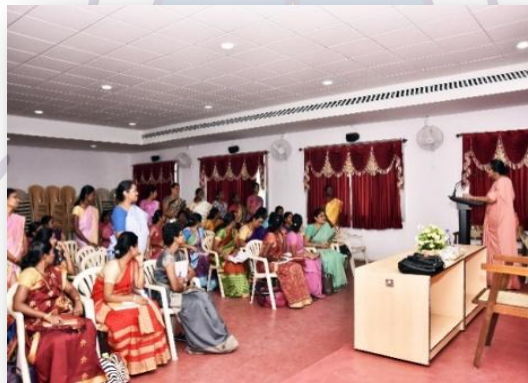
GLIMPSES OF THE SESSIONS