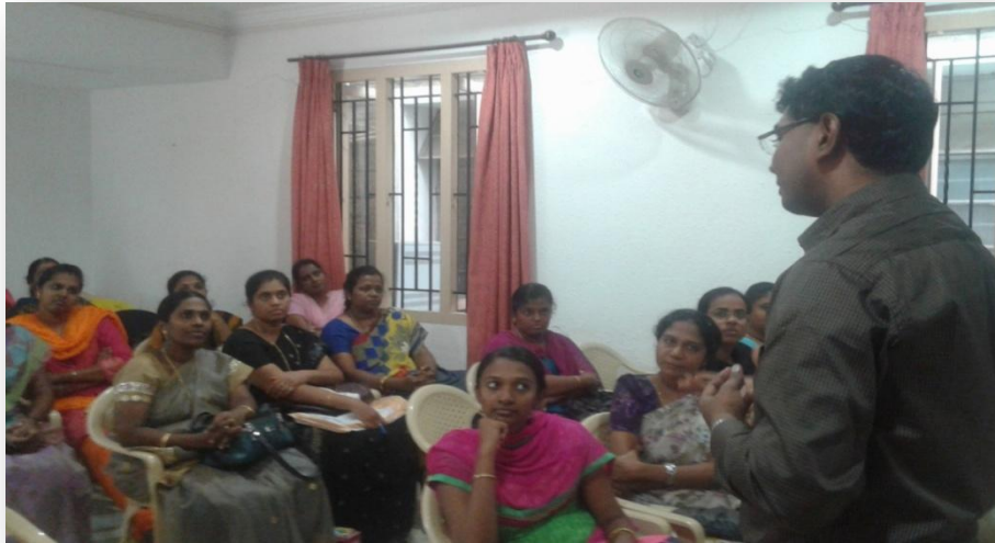
Batch I of our staff who attended the IL&FS Effective Communication Skills Course