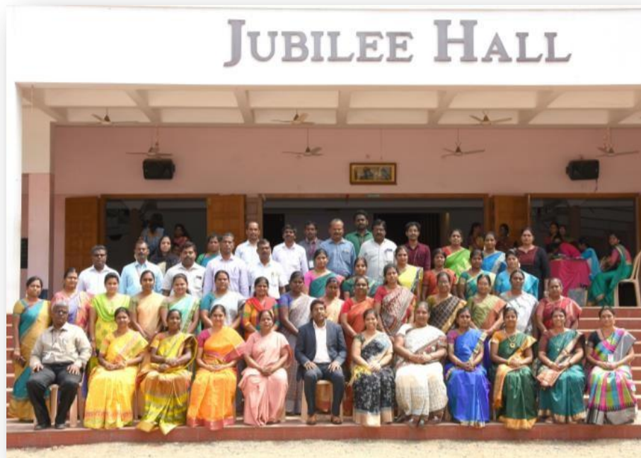
The delegates with the Resource Persons and the IQAC of Fatima College