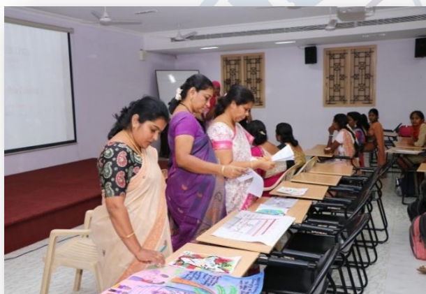
Paintings on Display for the Judges