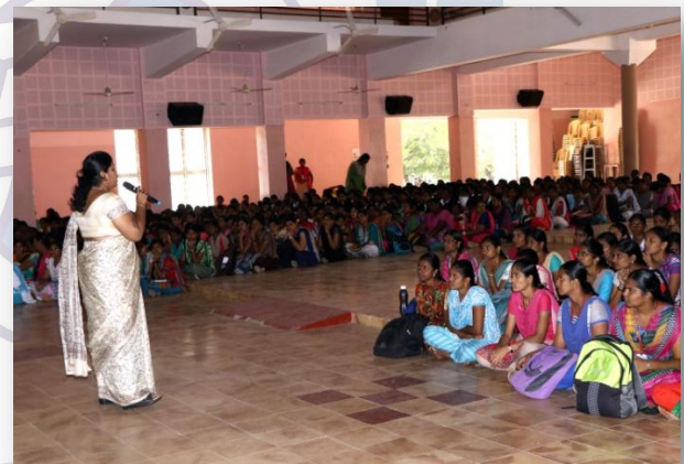
DR.DHEEP AND TEAM INTERACTING WITH STUDENTS