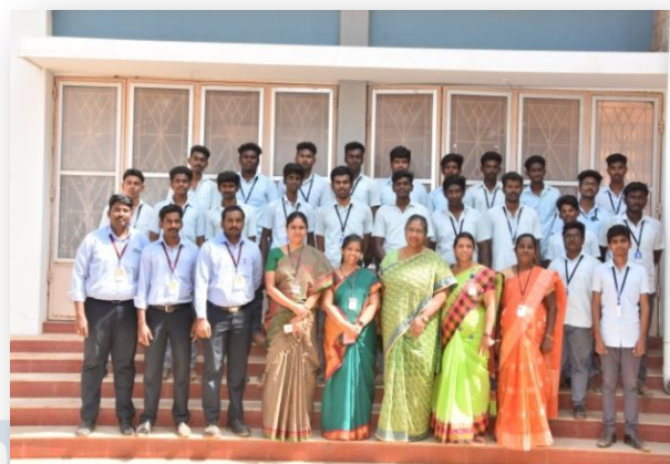
THE IQAC TEAM WITH THE STAFF AND STUDENTS OF Subbulakshmi Lakshmipathy College