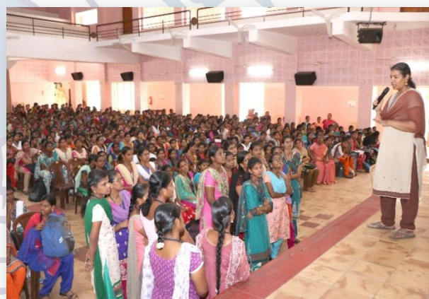
STUDENTS AT THE PASSPORT OFFICE