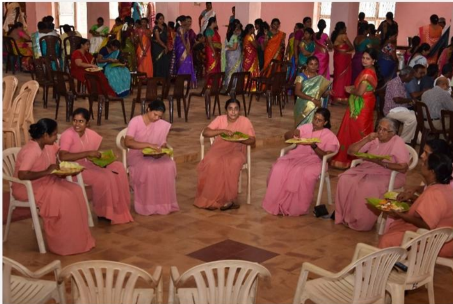
Sumptuous Lunch: Management, Teaching, Non-teaching and Sub-staff