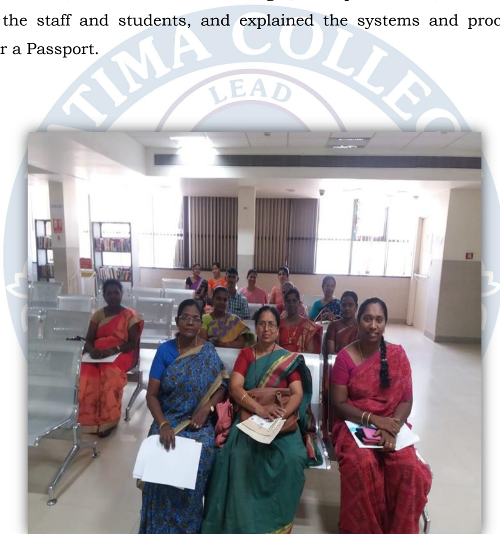
Our Staff at the Regional Passport Office, Madurai