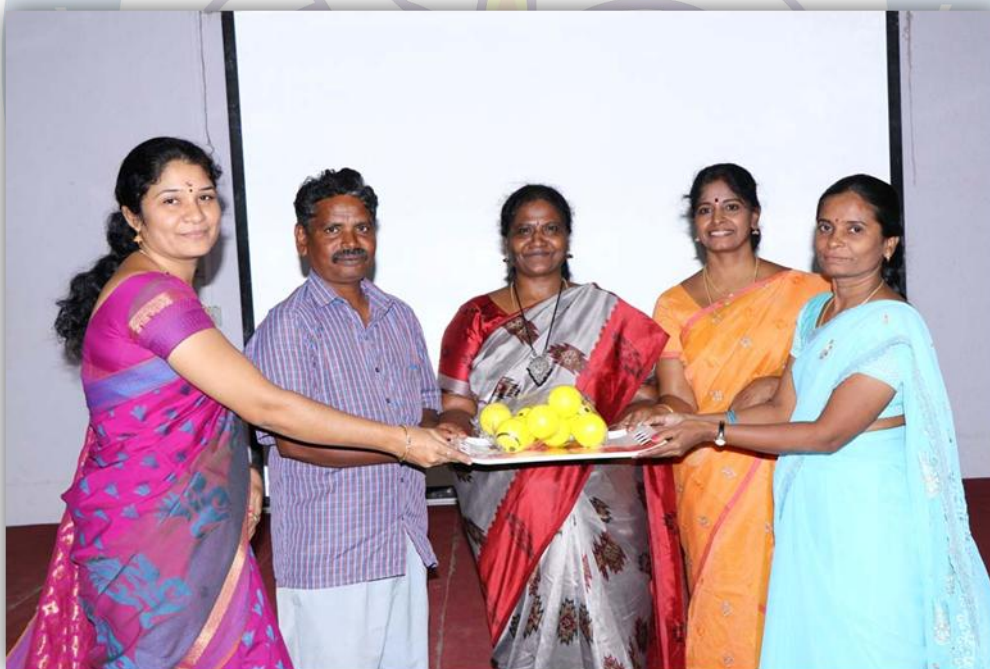
Videos of the relaxing “Work – Life Balance” Session