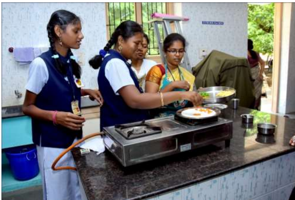
Nutritious Recipe Preparation by Bethshan School Girls