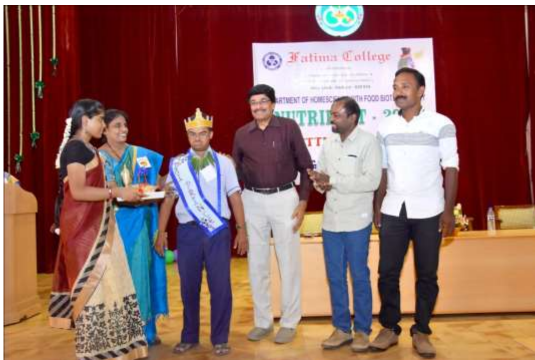
Crowning of Nutri Prince