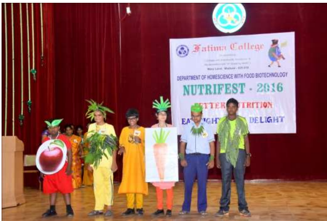
Nutri Parade by Bethshan School Children