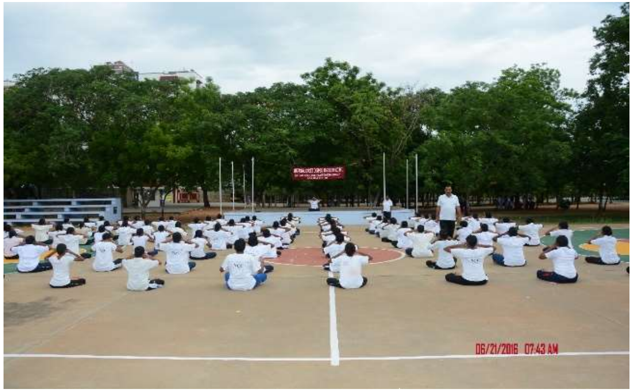
Students practiced yoga on International Yoga Day 21.06.2016