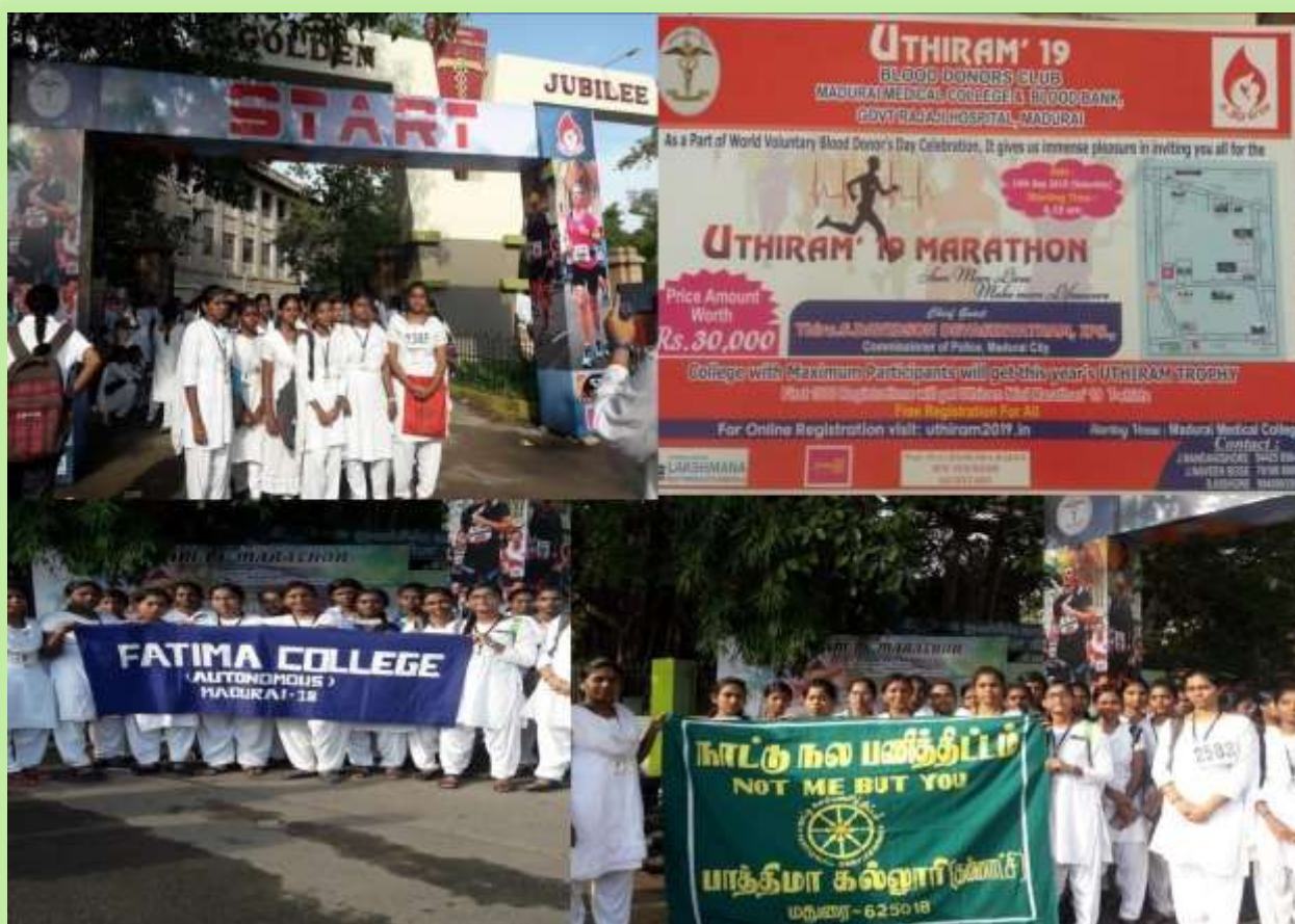
Students actively participating in the marathon