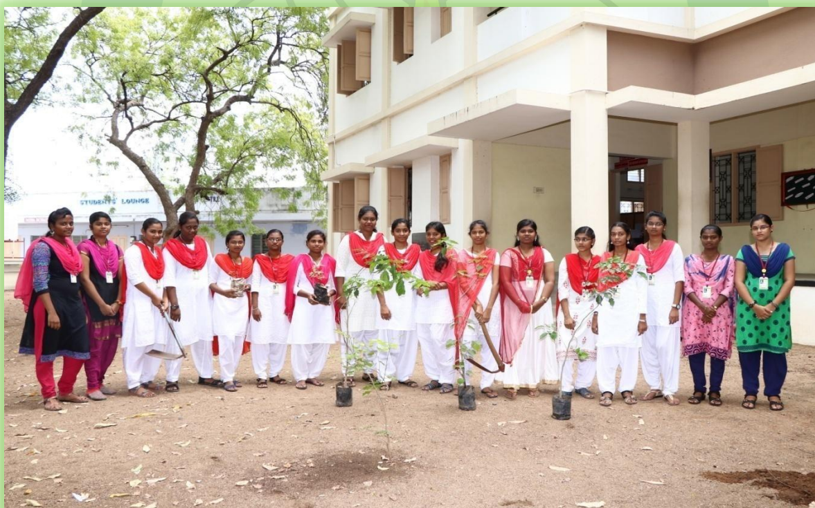
Student Volunteers of Youth Red Cross