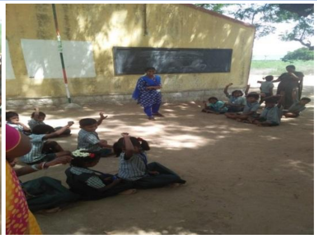
NSS students giving awareness to the school children about Clean India Program