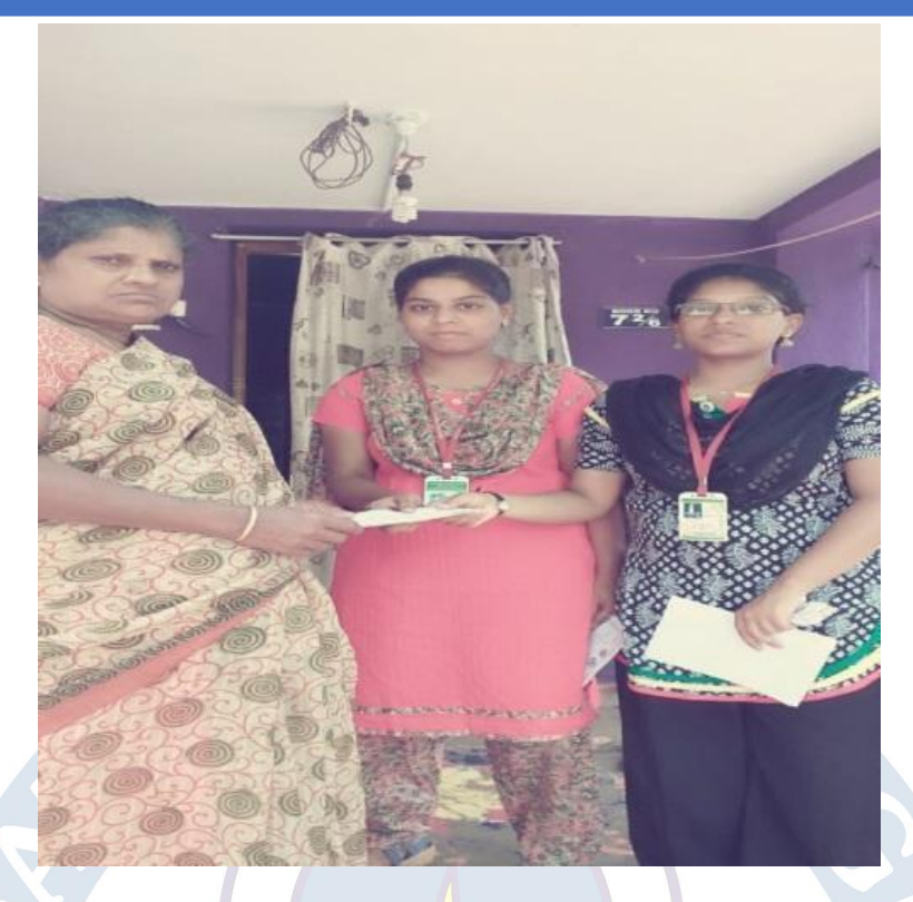
Students distributing pamphlet to the public