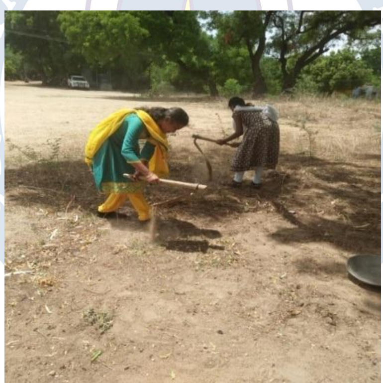
Cleaning Activity carried out in Vishalakshi School premises