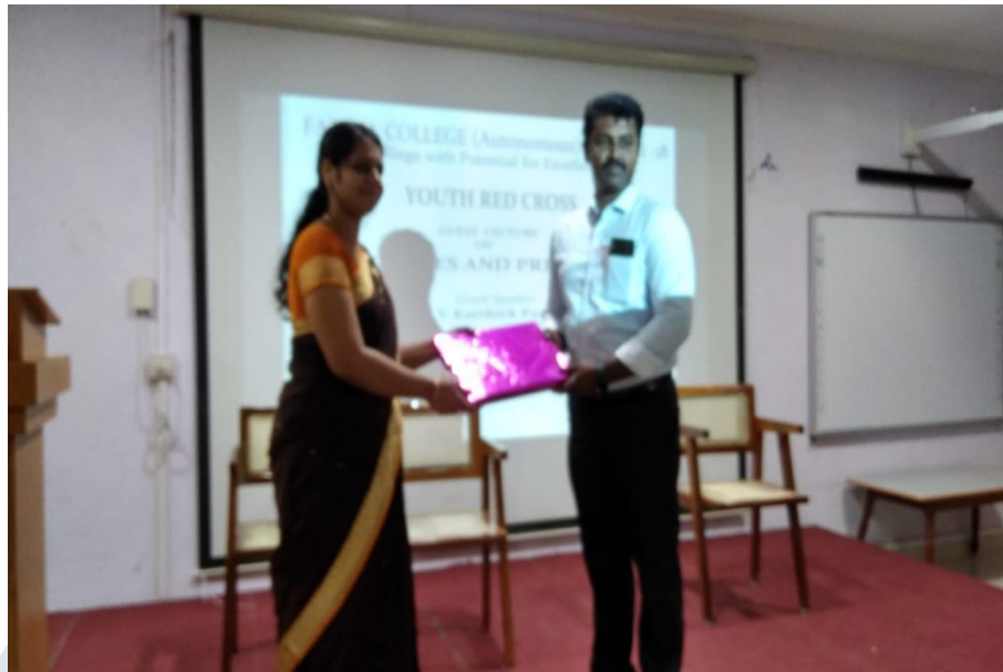
Coordinator welcomes the Chief Guest with the Memento