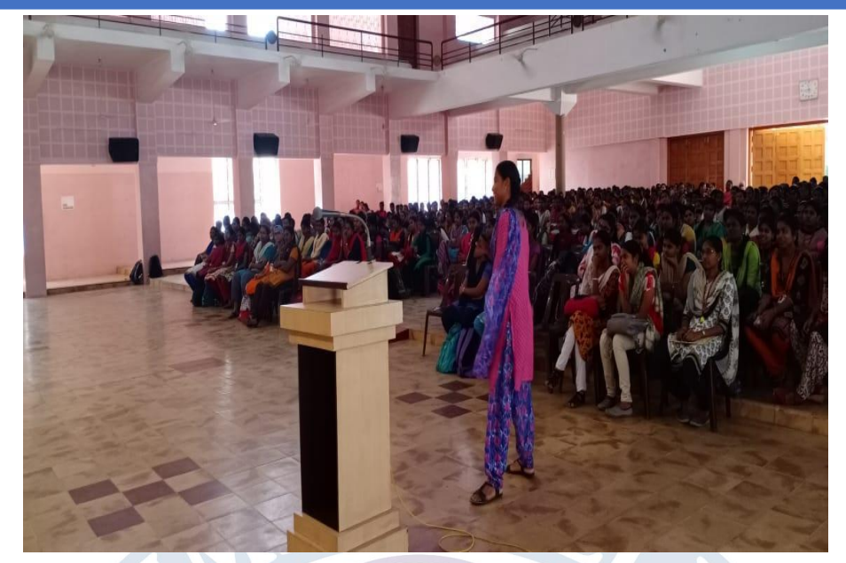
Student asked question related to health issues