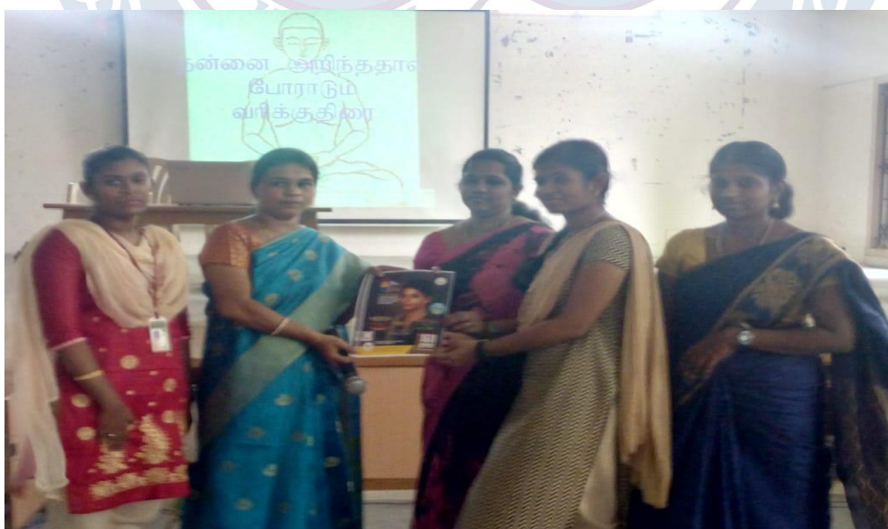
The Speaker giving the Toll Free number for Women’s Safety to our students