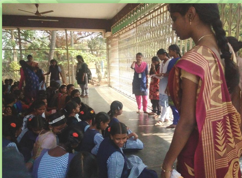
Awareness program on “Hygiene and Cleanliness”