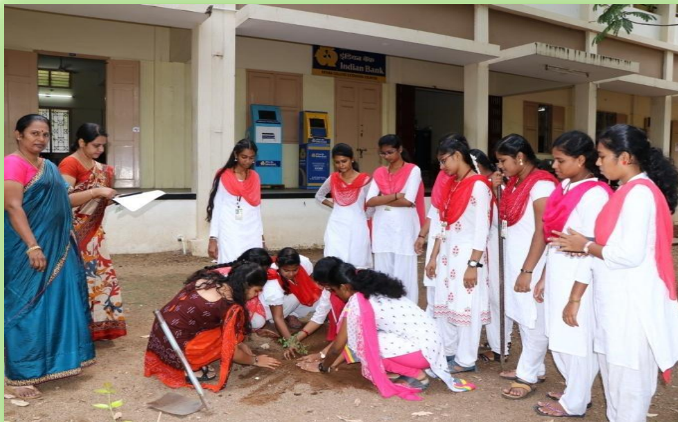
Student Volunteers of Youth Red Cross