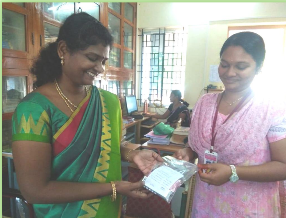
Student of the Youth Red Cross gave the first aid kit to the Staff of Shift II