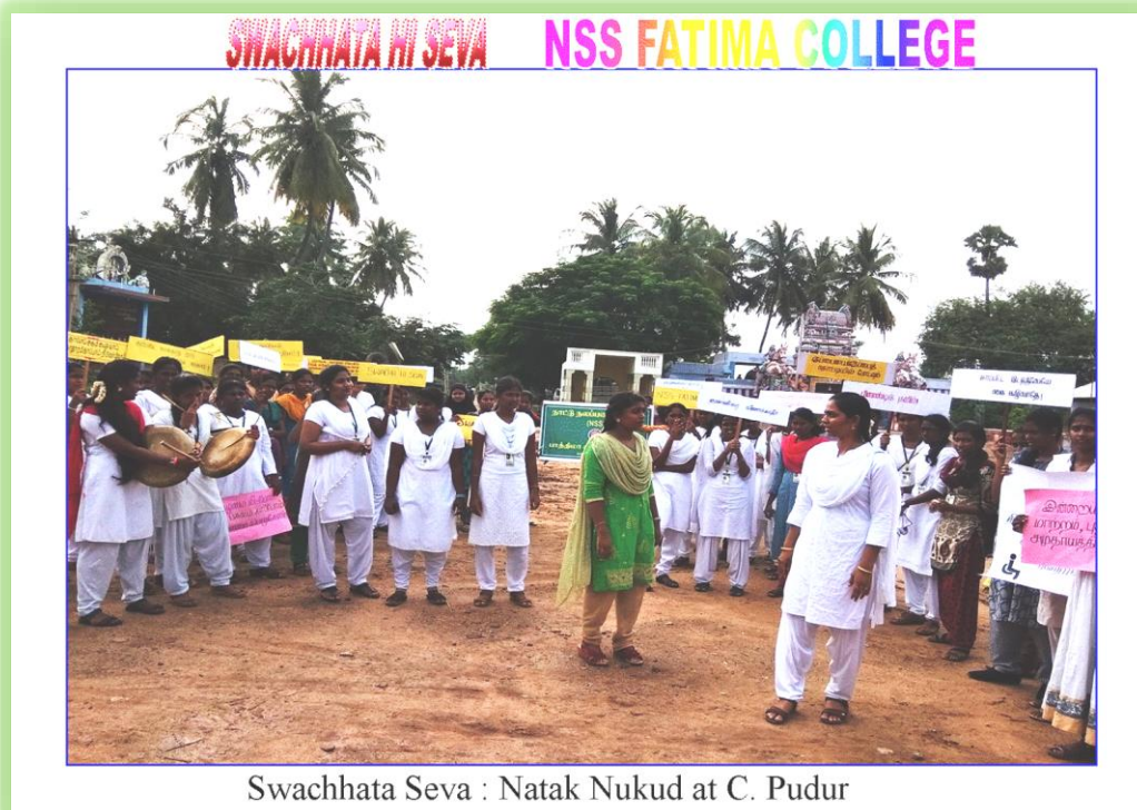
Swachhata Seva : Natak Nukud at C. Pudur

NSS volunteers sang a group song composed by them related to clean environment and plastic pollution. Finally the programme was ended with oath taking on clean India and always remains committed towards cleanliness.