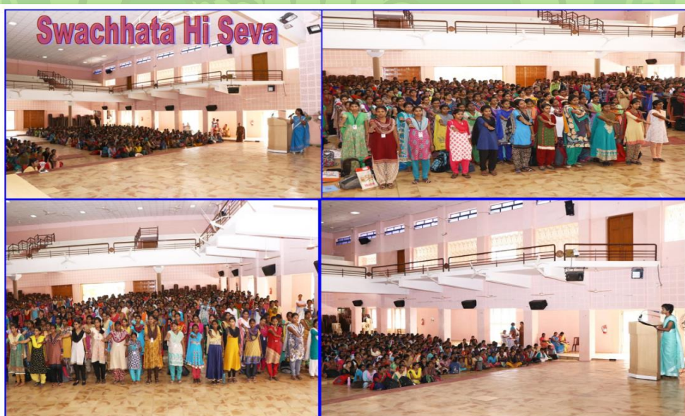
Objectives of Swachhata Hi Seva & Swachhata Oath taken by NSS volunteers

The Swachhata Hi Seva activities commenced in the Maryland campus on 15.09.2018. To reinforce the importance of a clean environment, the nationwide objectives of Swachhata Hi Seva were explained by program officers of NSS. Swachhata Seva Oath was taken by NSS volunteers and activities to be performed in schools and villages were planned.