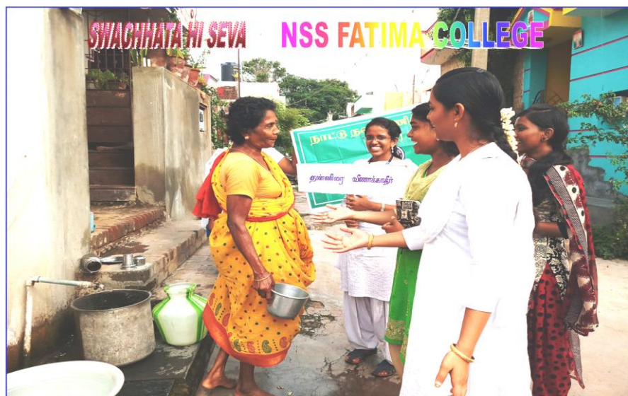
DOOR TO DOOR CAMPAIGN AT POTHUMBU