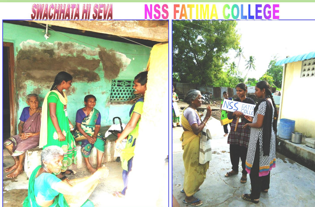
DOOR TO DOOR CAMPAIGN