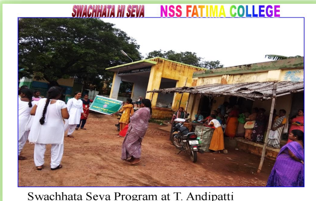
Swachhata Seva Program at T. Andipatti

NSS students conducted street play on how to keep the surroundings clean starting from one's home to the entire country.