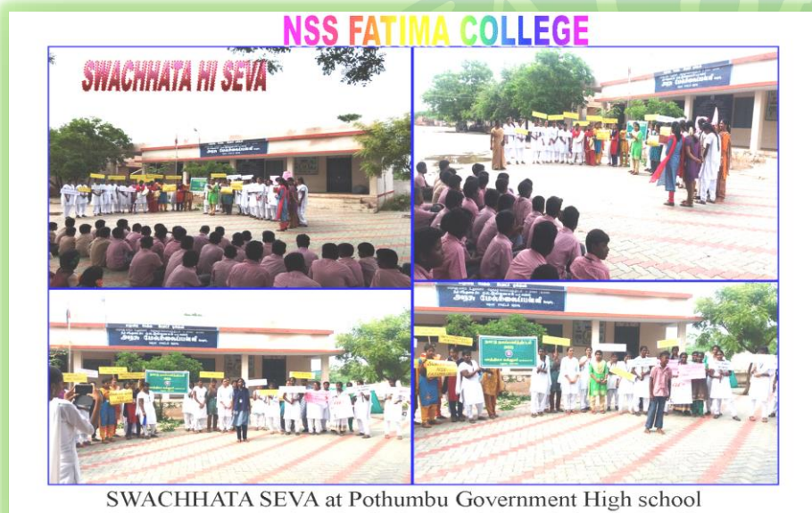
SWACHHATA SEVA at Pothumbu Government High school

A door to door campaign was performed on 'No Plastics' and solid waste management to insist the importance of a clean environment. As a special effort, students sensitized the village women on 'Environmental Hygiene' so as to lead a healthy life.