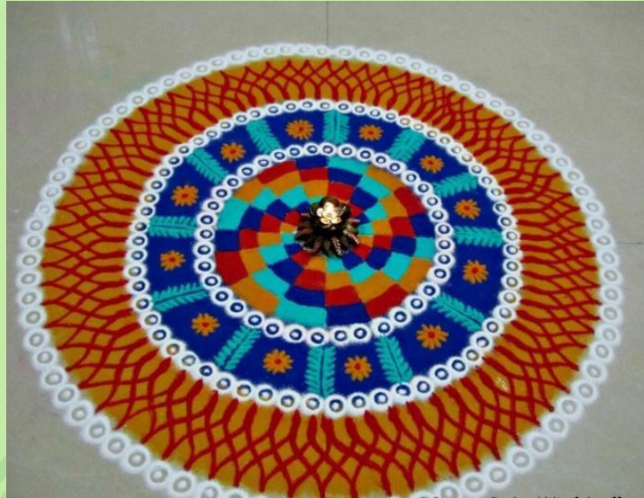
Traditional Rangoli by the students of IT