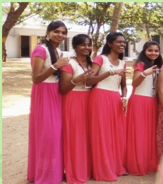
Contestants in Group Song