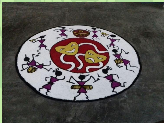
Modern art by Mathematics shift 2 students