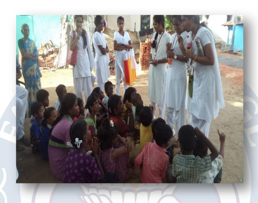
DEMO GIVEN IN FINDING HARMFUL COMPONENTS IN SOFT DRINKS

IDENTIFYING ORIGINAL HONEY, FINDING COMPOSITION IN COOL DRINKS, ADULTERATION IN SPICES 07.09.2019