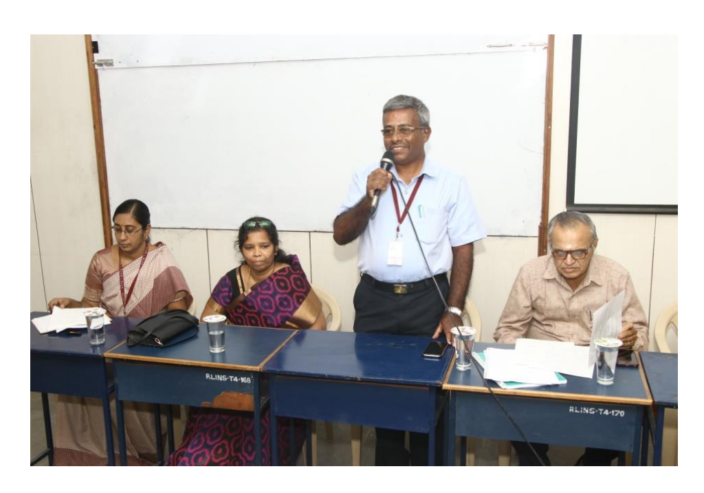
At the Training Session