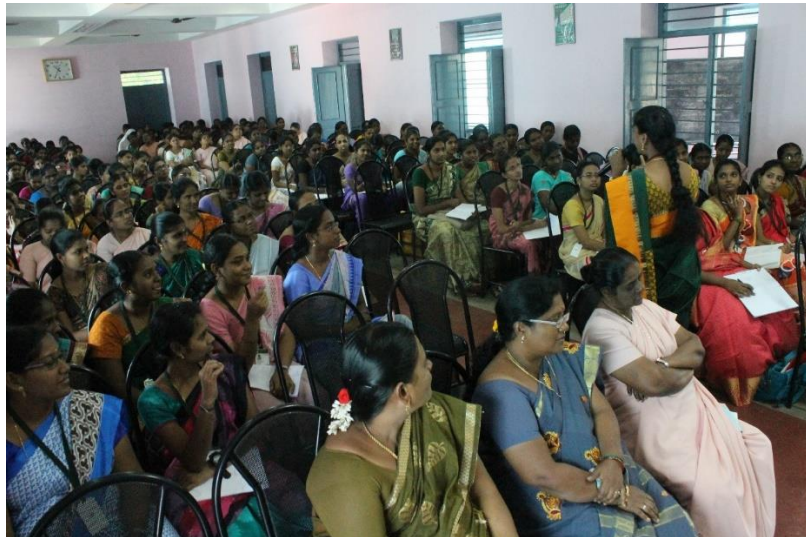
Participants involved in an Activity