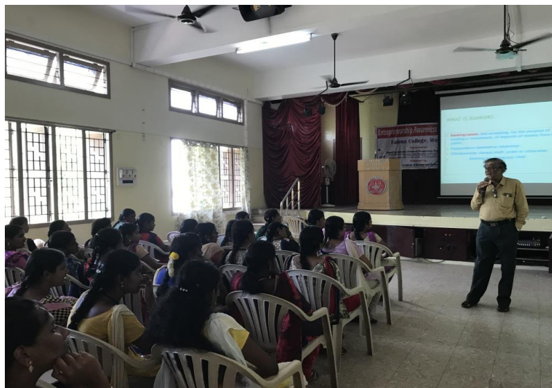
Financial Aspects – Interaction with students