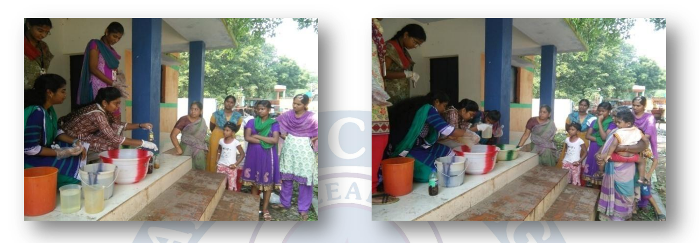
PHENOYL PREPARED WAS DISTRIBUTED TO VILLAGERS