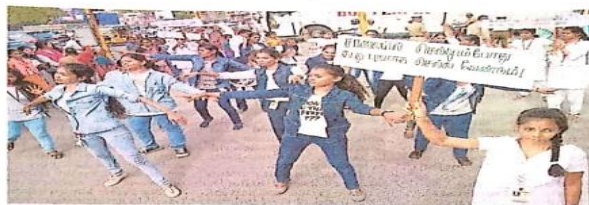
Dance movement: Students of Fatima College staging a flash mob at Goripalayam junction in Madurai on Monday.