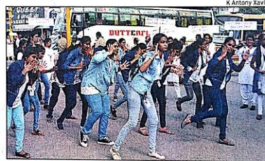
SHAKING A LEG FOR ROAD SAFETY: Fatima College students performing a flash mob at Goripalayam junction

Students from Fatima College's Department of Journalism and Mass Communication performed flash mobs at Goripalayam junction and outside Madurai Railway Station, carrying the message of wearing helmets and staying safe on roads. "The inspiration for coming up with such an activity started within the college. We noticed that many students didn't wear helmets properly or they used to wear them only