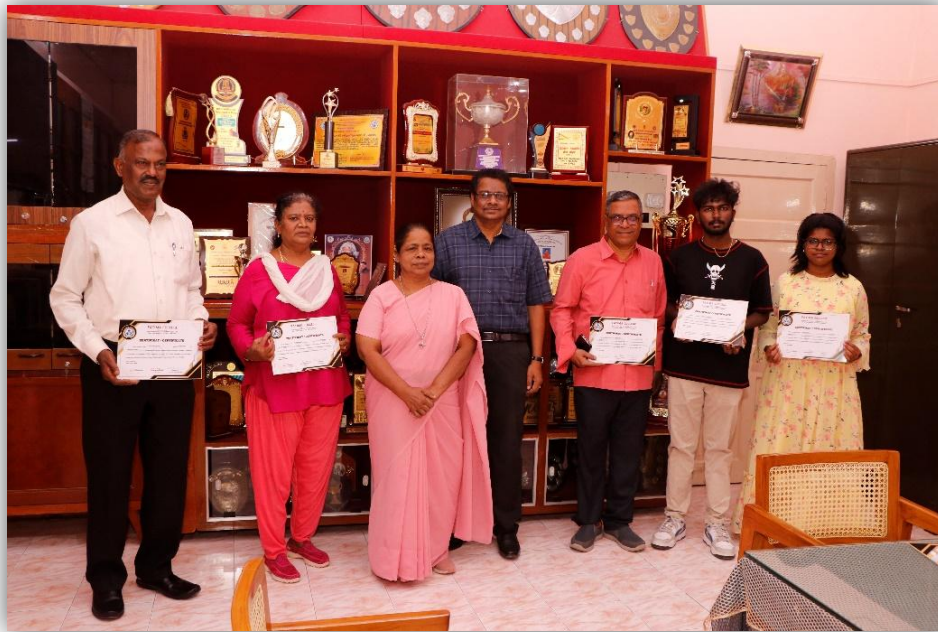
Certificates issued to the Students

Affiliated to Madurai Kamaraj University Re-Accredited with 'A++' by NAAC (Cycle - IV) Mary Land, Madurai - 625018, Tamil Nadu