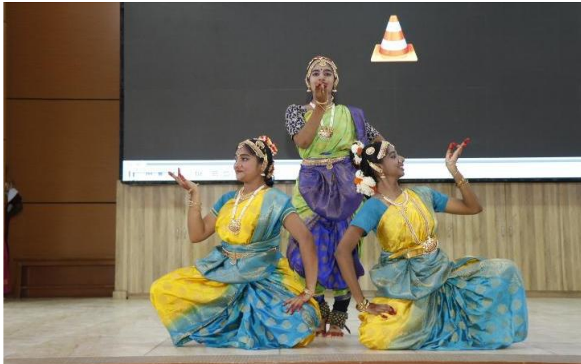
Captivating Classical Dance

Affiliated to Madurai Kamaraj University Re-Accredited with 'A++' by NAAC (Cycle - IV) Mary Land, Madurai - 625018, Tamil Nadu