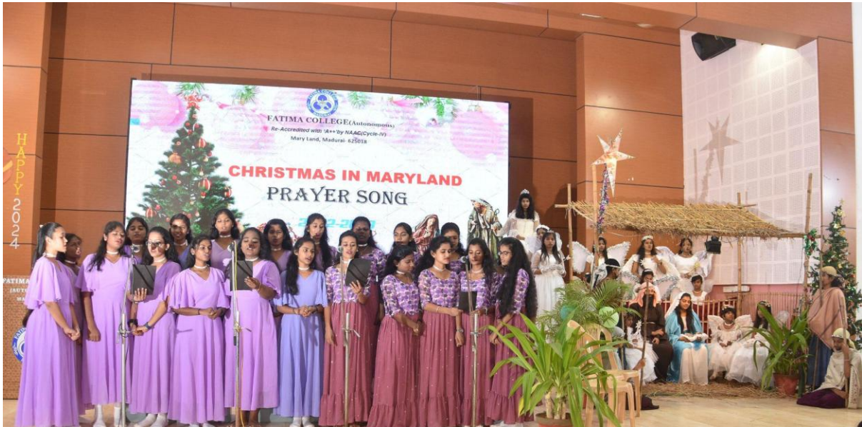
Celebrating the arrival of Infant Jesus