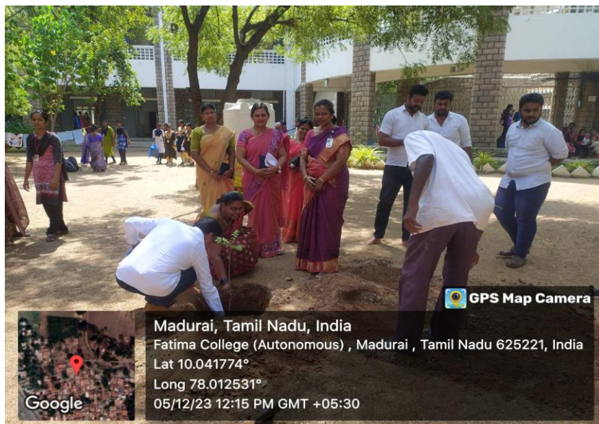
Planting the sapling