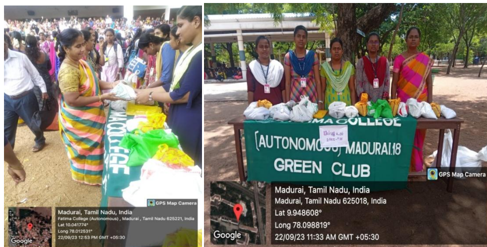
Stalls in 'Sales Fiesta'

stall was put up on 22.09.2023, which attracted the attention of the parents. Many were delighted from buying the vermicompost packs. The Staff-in-charge of Green Club from both Shift I & II rendered their fullest support to the successful completion of the event.