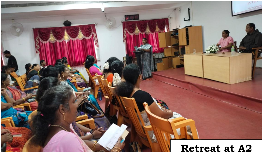
Retreat at A2