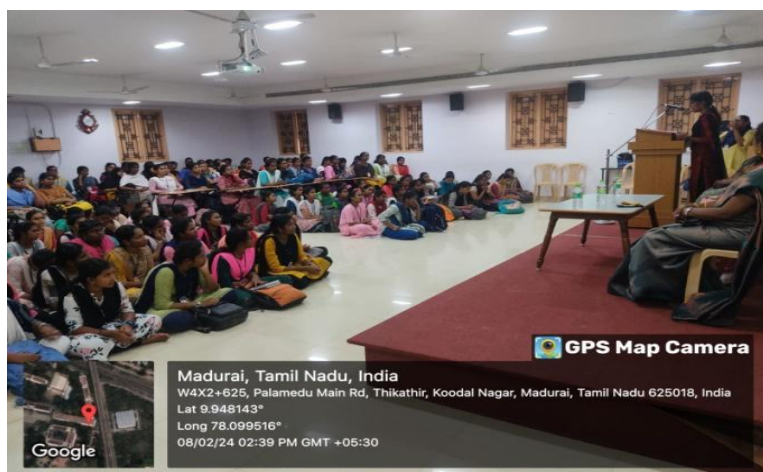
Student welcoming our chief guests