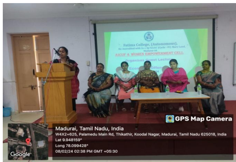
Chief guest address the students