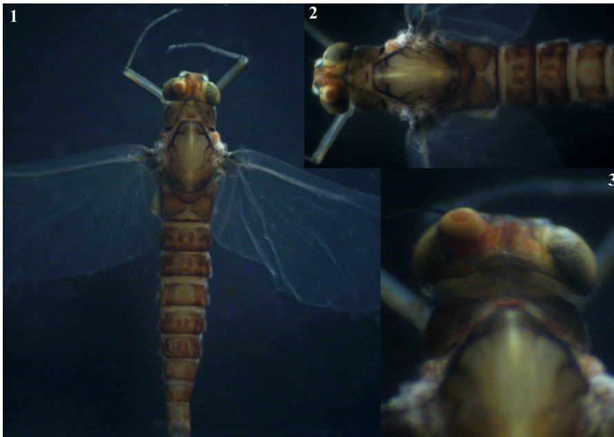
Figures 1–3. Gynandromorph subimago of Centroptella (Chopralla) ghatensis Kluge, 2021: (1) entire view; (2) head and thorax; (3) closer view of head.