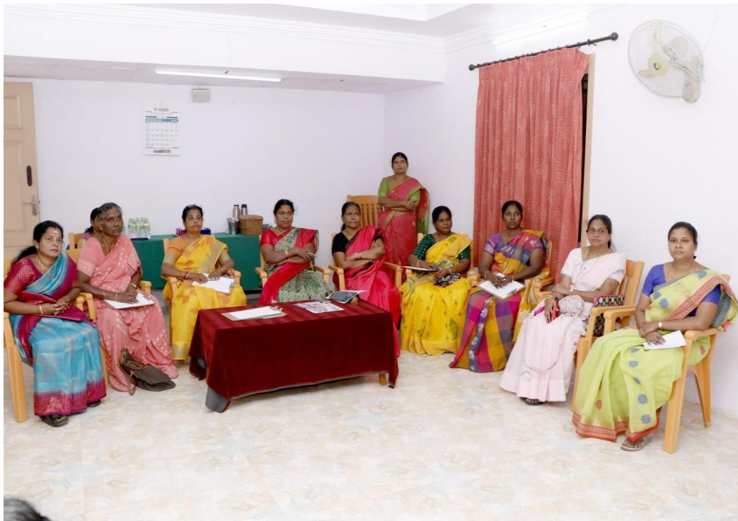
Stage II Jury team on 19.02.24