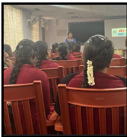
Resource Person answering to the Queries