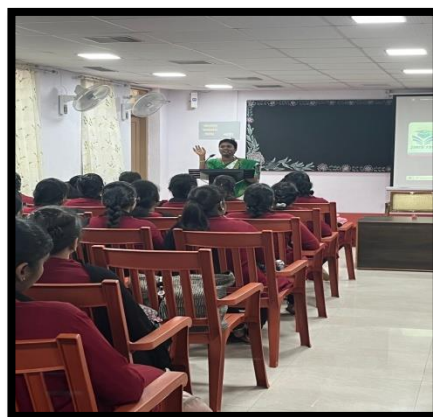
Students listening to the resource person