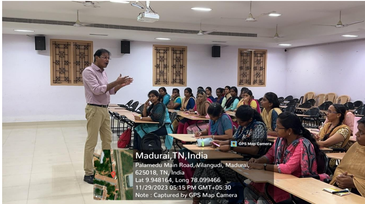
Figure 1 The resource person presenting his insights to the outgoing students

Affiliated to Madurai Kamaraj University Re-Accredited with 'A++' by NAAC (Cycle - IV) Mary Land, Madurai - 625018, Tamil Nadu