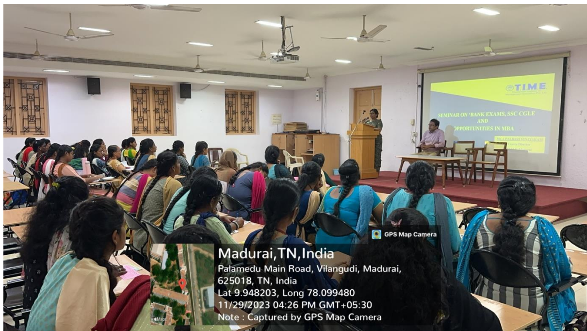
Figure 2 The resource person listening to the feedback session