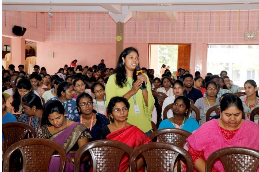
Interactive Session with the participants

Affiliated to Madurai Kamaraj University Re-Accredited with 'A++' by NAAC (Cycle - IV) Mary Land, Madurai - 625018, Tamil Nadu