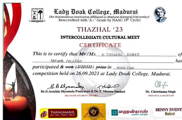
Certificates of students' participation in various competitions inside and outside the college

Students' participation in competitions is also encouraged in the department which is an integral part of their learning. This is by providing them with a variety of opportunities to voice their ideas and make choices.