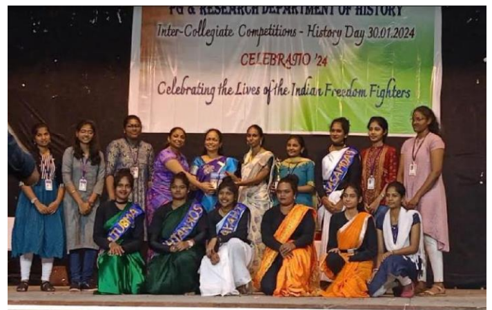
Student participation in competitions