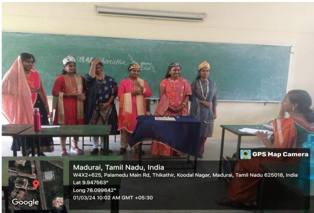
Enactment of Mahabharatha by students for a drama course