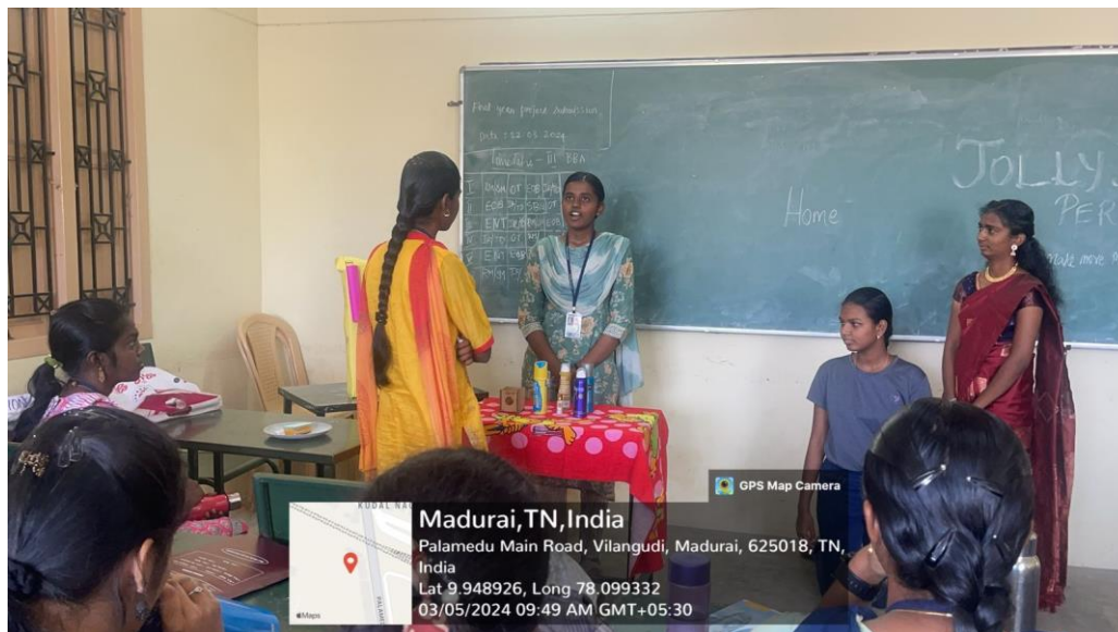
Students engaged in a participative group activity in part II English class.