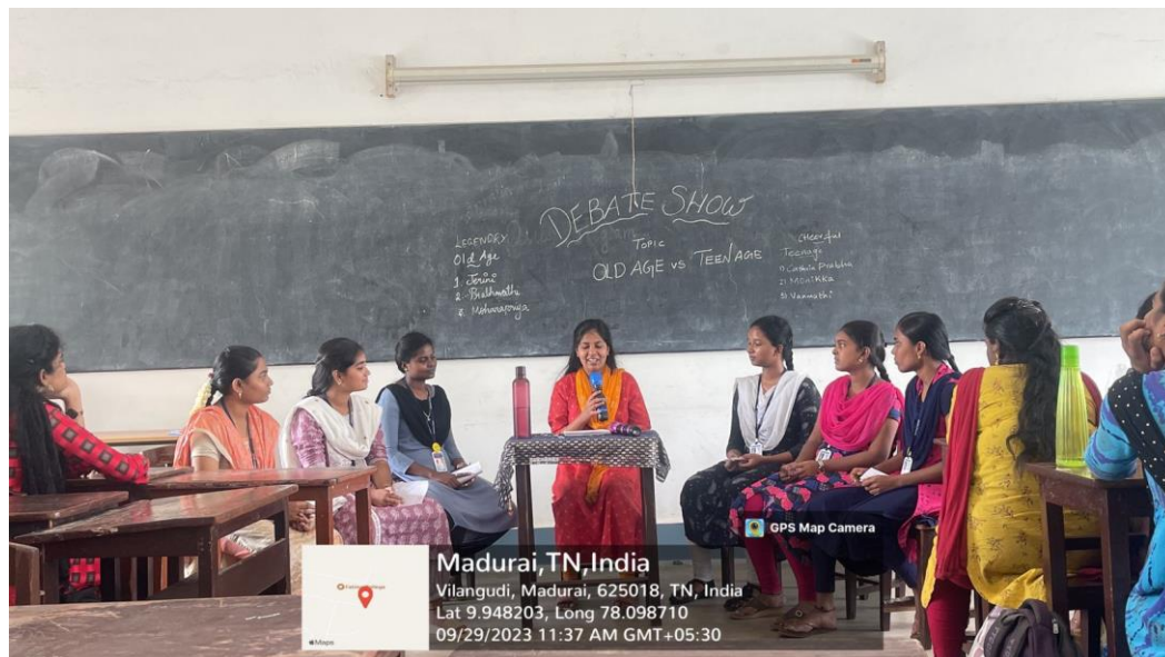
Debate conducted for students for the course Oral Presentation Skills