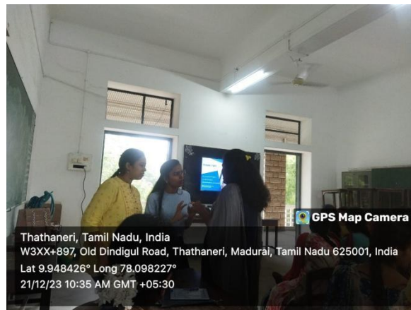
Students interacting with the speaker