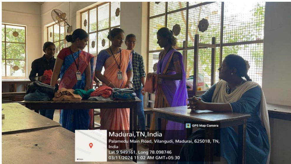
Students advertising a product.