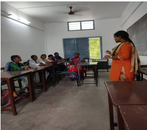
Student taking seminar

Participatory learning is “the body of the lesson, where learners are involved as actively in the Learning process as possible. There is an intentional sequence of activities or learning events that will help the learner achieve the specified objective or desired outcome”.