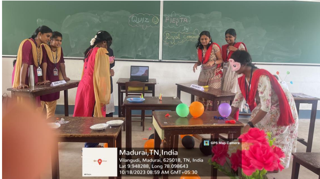
Language games organised for Part II English students

Affiliated to Madurai Kamaraj University Re-Accredited with 'A++' by NAAC (Cycle - IV) Mary Land, Madurai - 625018, Tamil Nadu