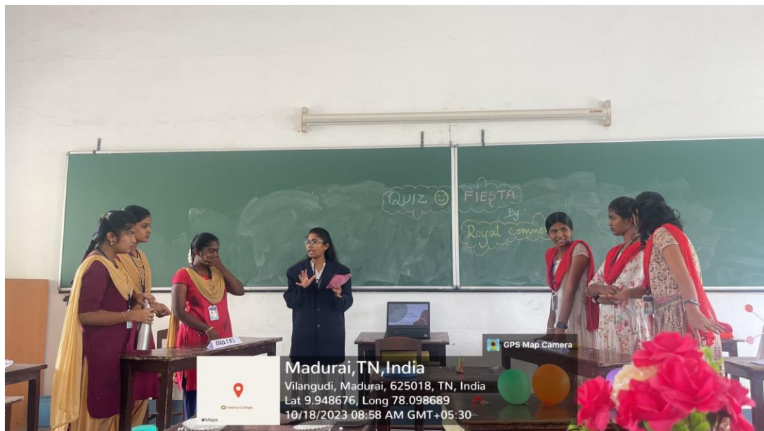
Quiz Programme conducted in Part II English class