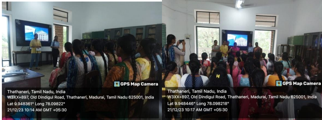
Speakers addressing the Students

insights about the scholarships and the funds provided by the government for various research programs encourage the students to actively pursue their studies in research.