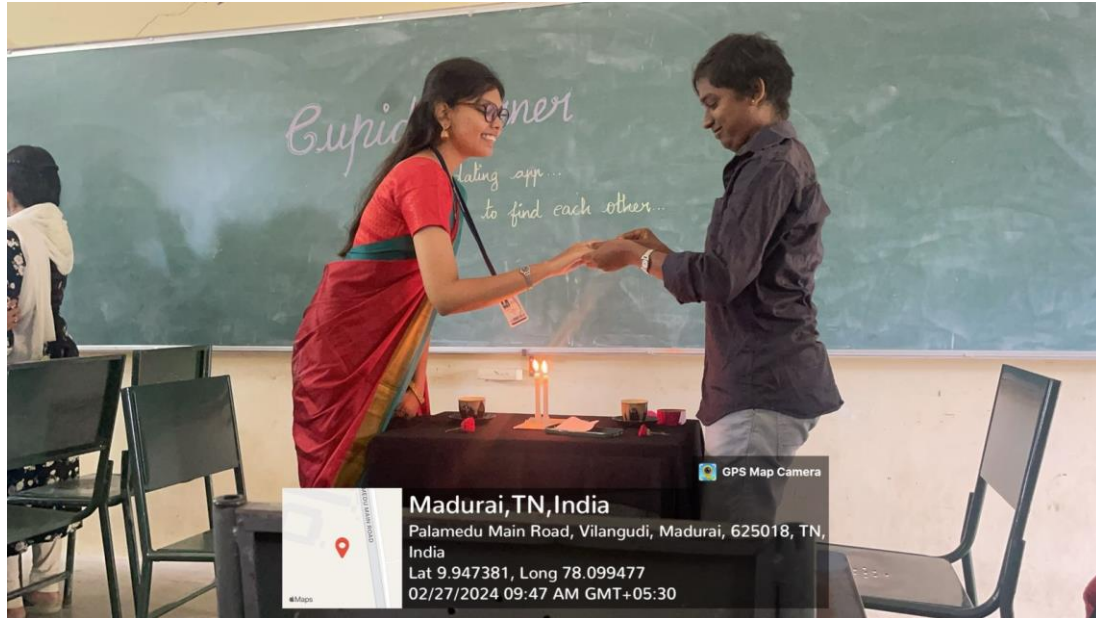
Students of I BA English enacting a scene from a play.

Affiliated to Madurai Kamaraj University Re-Accredited with 'A++' by NAAC (Cycle - IV) Mary Land, Madurai - 625018, Tamil Nadu