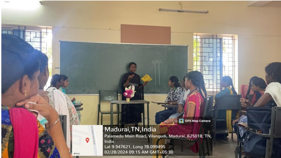
Literary Quiz organised for students of BA English