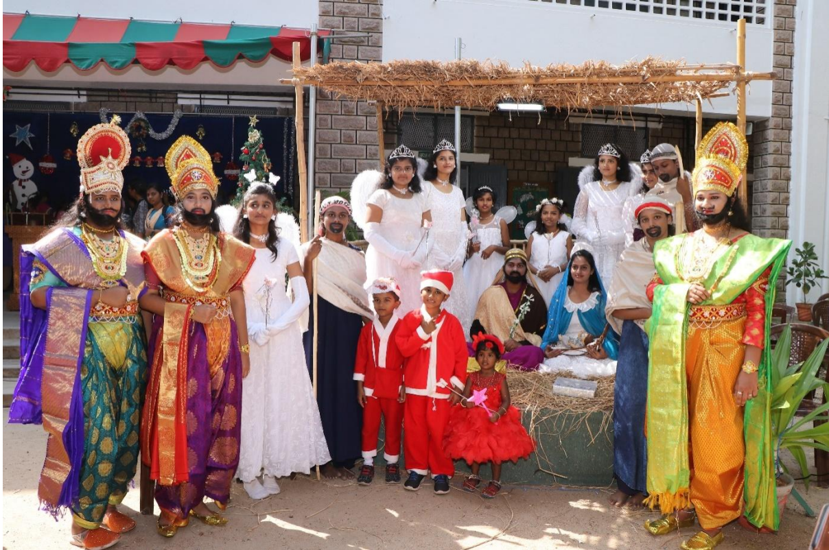
Celebrating the arrival of Infant Jesus