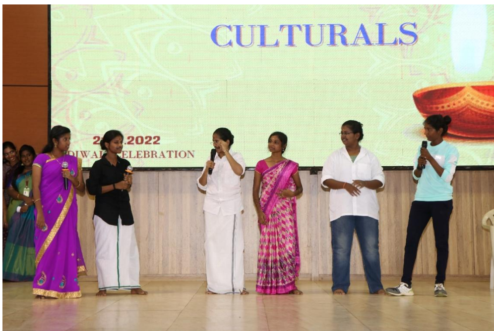
Thought-provoking Skit by Fatimites