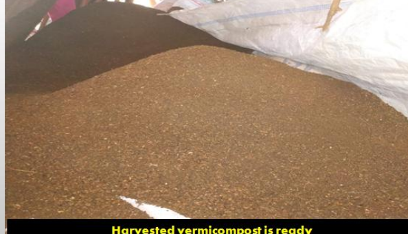
Harvested vermicompost is ready