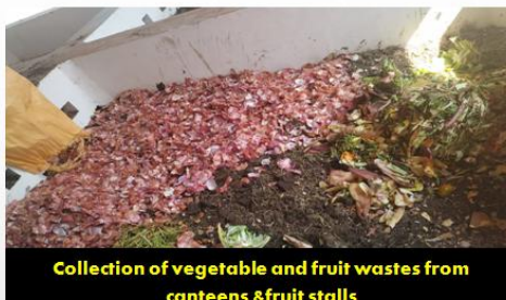
Collection of vegetable and fruit wastes from canteens & fruit stalls