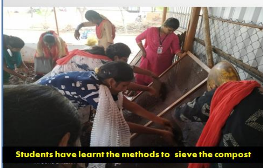
Students have learnt the methods to sieve the compost