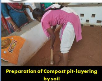
Preparation of Compost pit- layering by soil