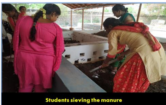
Students sieving the manure