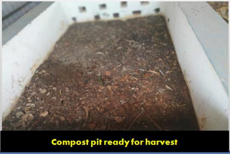
Compost pit ready for harvest