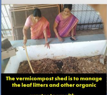
The vermicompost shed is to manage the leaf litters and other organic wastes to wealth