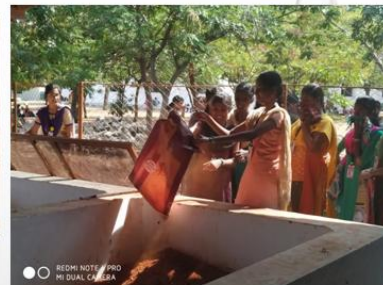
Cow dung and the collected dry litter from the campus which was already put in regular basis in a pit located in the vermicompost shed.