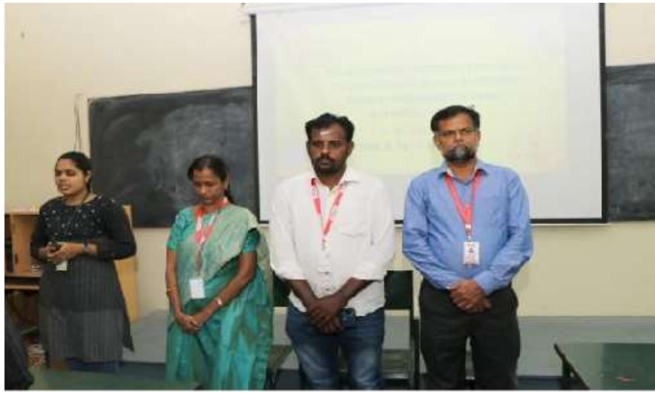
Resource Persons of Day I Session I & II

Affiliated to Madurai Kamaraj University Re-Accredited with 'A++' by NAAC (Cycle - IV) Mary Land, Madurai - 625018, Tamil Nadu