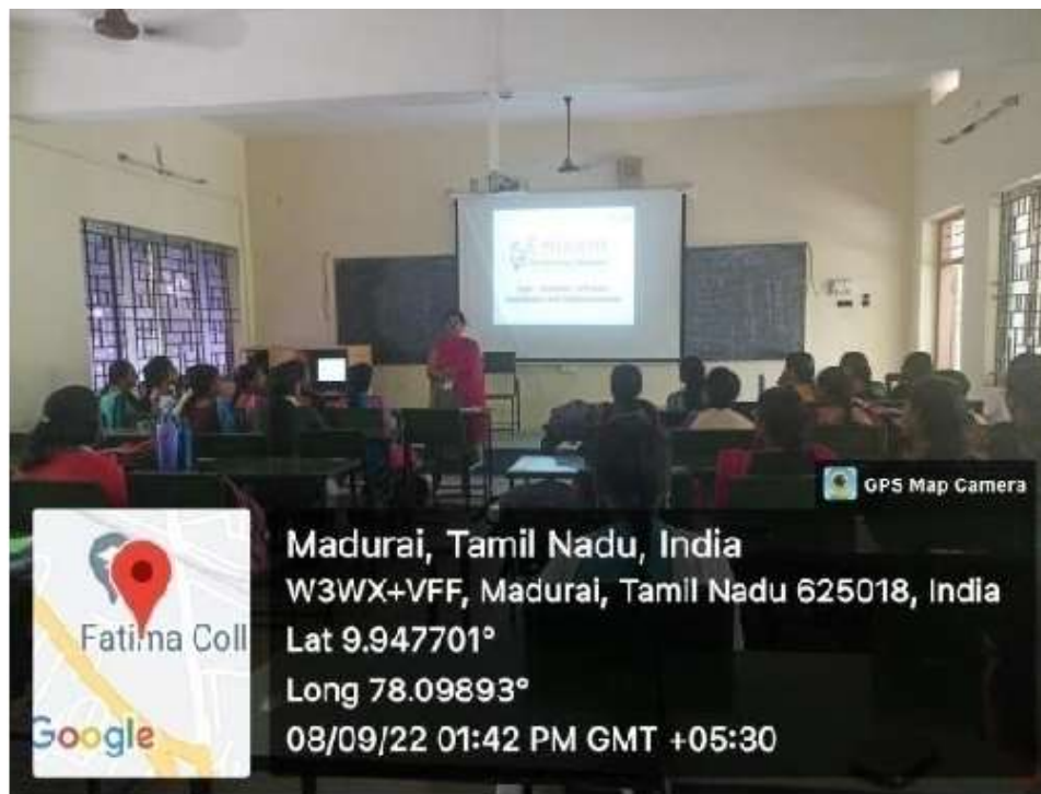
Resource Persons of Day II Session II