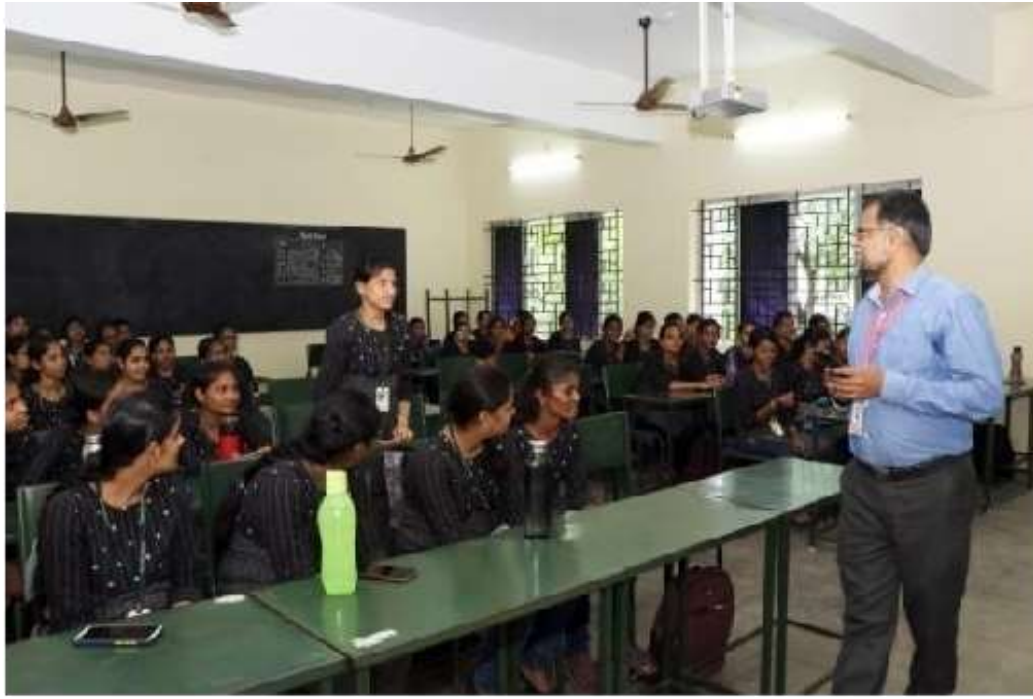
Resource Person interacting with students

Affiliated to Madurai Kamaraj University Re-Accredited with 'A++' by NAAC (Cycle - IV) Mary Land, Madurai - 625018, Tamil Nadu