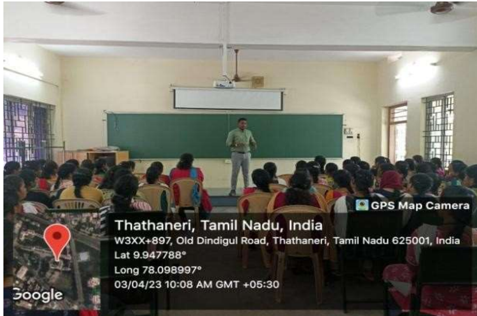
Resource person delivering lecture

Affiliated to Madurai Kamaraj University Re-Accredited with 'A++' by NAAC (Cycle - IV) Mary Land, Madurai - 625018, Tamil Nadu