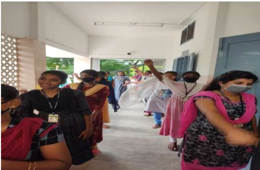
Students doing Physical Activity