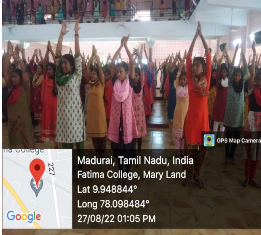
Students performing Tadasana

Affiliated to Madurai Kamaraj University Re-Accredited with 'A++' by NAAC (Cycle - IV) Mary Land, Madurai - 625018, Tamil Nadu