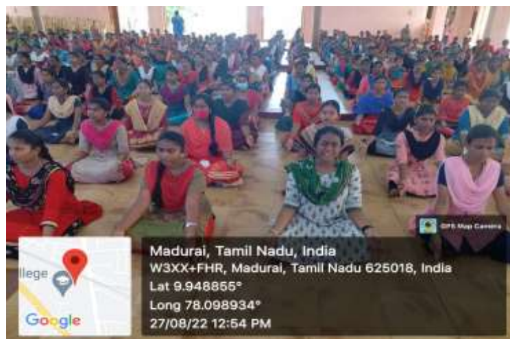
Students performing Meditation

ground including your back, think that they are getting relaxed. Observe how this energy moving in the abdominal area and chest area is helping us relax. Let the energy move into your shoulders, see how they are melting away, becoming lighter. Let this energy move to your biceps and elbows, forearms, your wrists, your palms and fingers, thumbs - all getting relaxed. Imagine the body between your shoulders and toes is completely relaxed. Feel this relaxation in your neck muscles, your facial muscles, forehead, and your earlobes. See how gently and softly your eyes are closed. Crown of your head - all getting relaxed. From the crown of your head, top of the head, till your toes, top to toe. Feel this complete relaxation. Having done this, gently bring your attention towards the heart and incorporate this practice of meditation on the heart. That there is divine light present in the heart and I am meditating on it, the energy that is pulling me inward, within my heart Advised to meditate regularly around 20 minutes or 30 minutes.