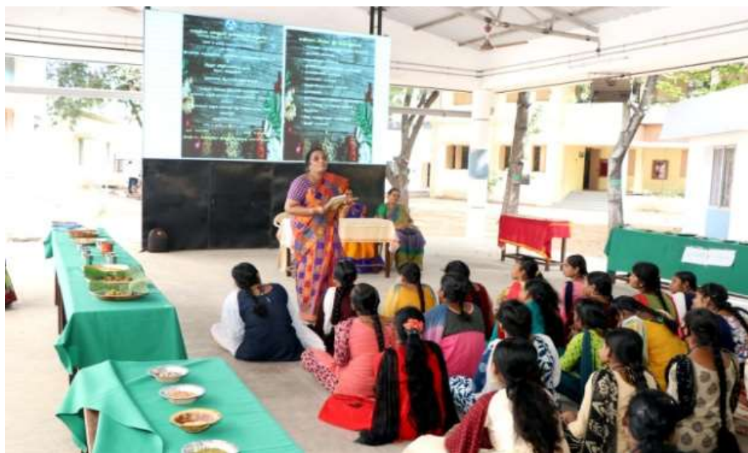
Resource Person delivering lecture

Affiliated to Madurai Kamaraj University Re-Accredited with 'A++' by NAAC (Cycle - IV) Mary Land, Madurai - 625018, Tamil Nadu