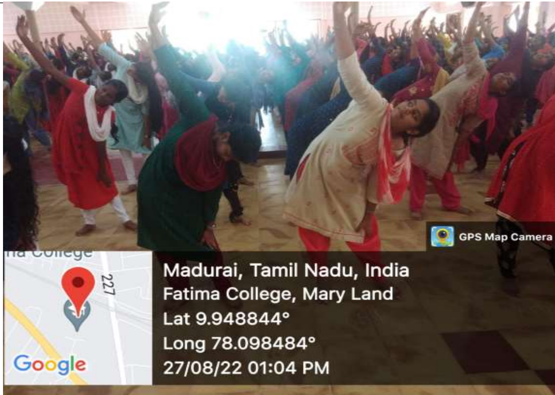
Students performing Trikonasana

Affiliated to Madurai Kamaraj University Re-Accredited with 'A++' by NAAC (Cycle - IV) Mary Land, Madurai - 625018, Tamil Nadu