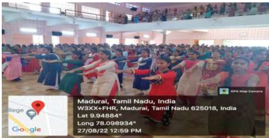
Students performing Utkatasana

Utkatasana strengthens the legs, back and arms. It tones the muscles of arms, legs and hips. It stretches shoulders. It improves heart health and the functioning of the digestive system.