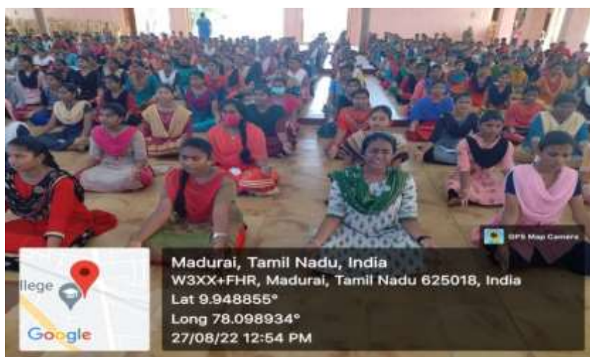
Students performing Vishuthi Chakra Clearance

Chakras play a role in the flow of energy in your body. When one or more of your chakras becomes blocked or unbalanced, it's thought to have an impact on your physical, mental, spiritual, and emotional health.