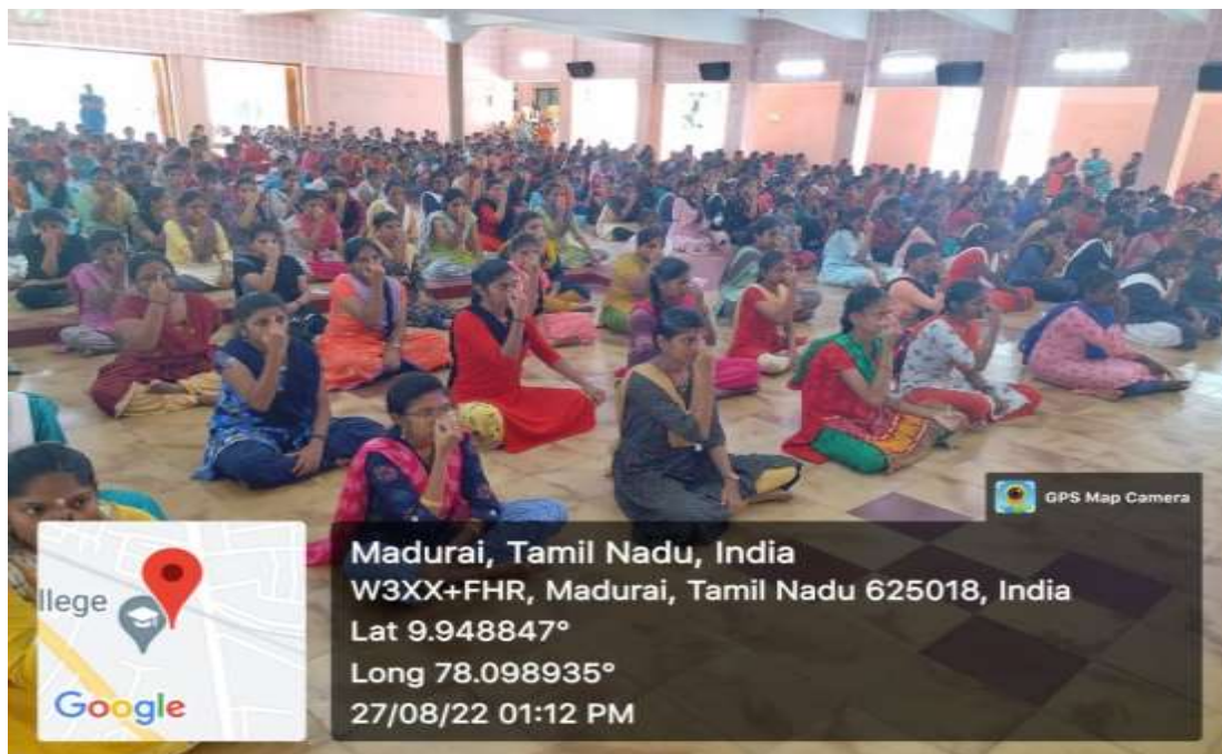
Students performing Pranaayama