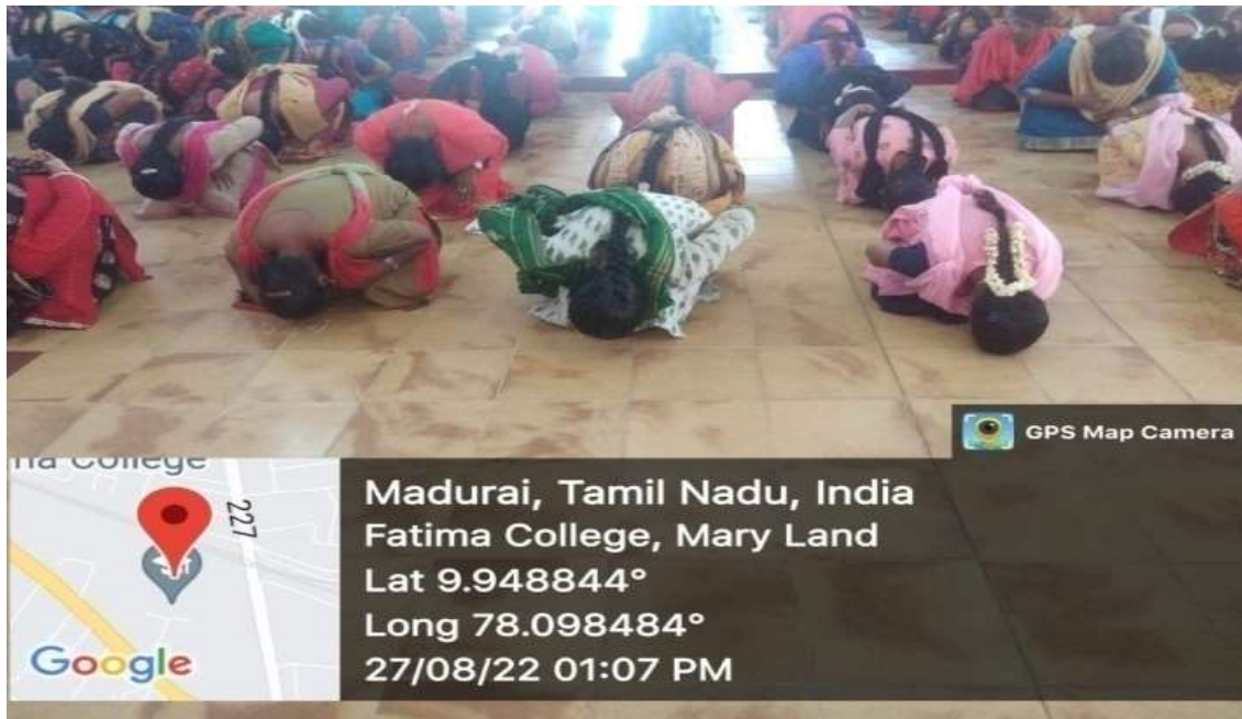
Students performing Vajrasana