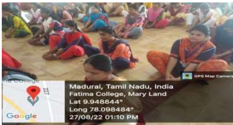
Students performing Baddhakonasana