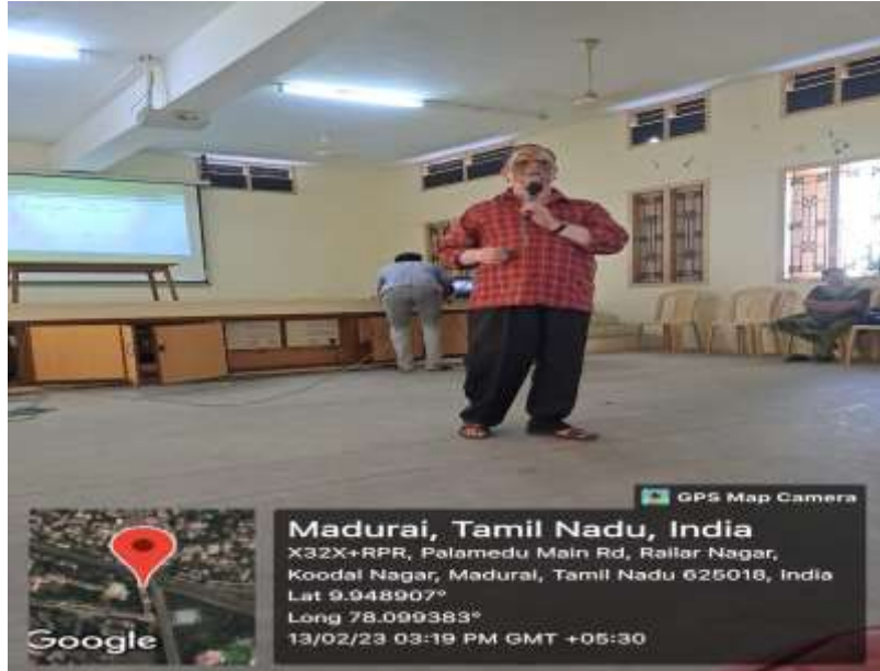
Resource Person addressing the students

Affiliated to Madurai Kamaraj University Re-Accredited with 'A++' by NAAC (Cycle - IV) Mary Land, Madurai - 625018, Tamil Nadu