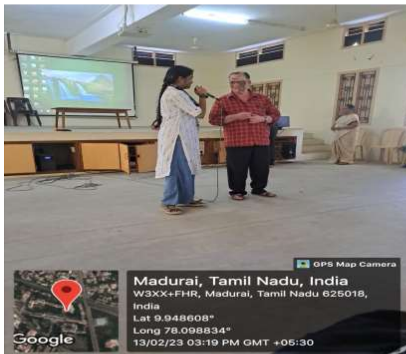
Students interacting with resource person