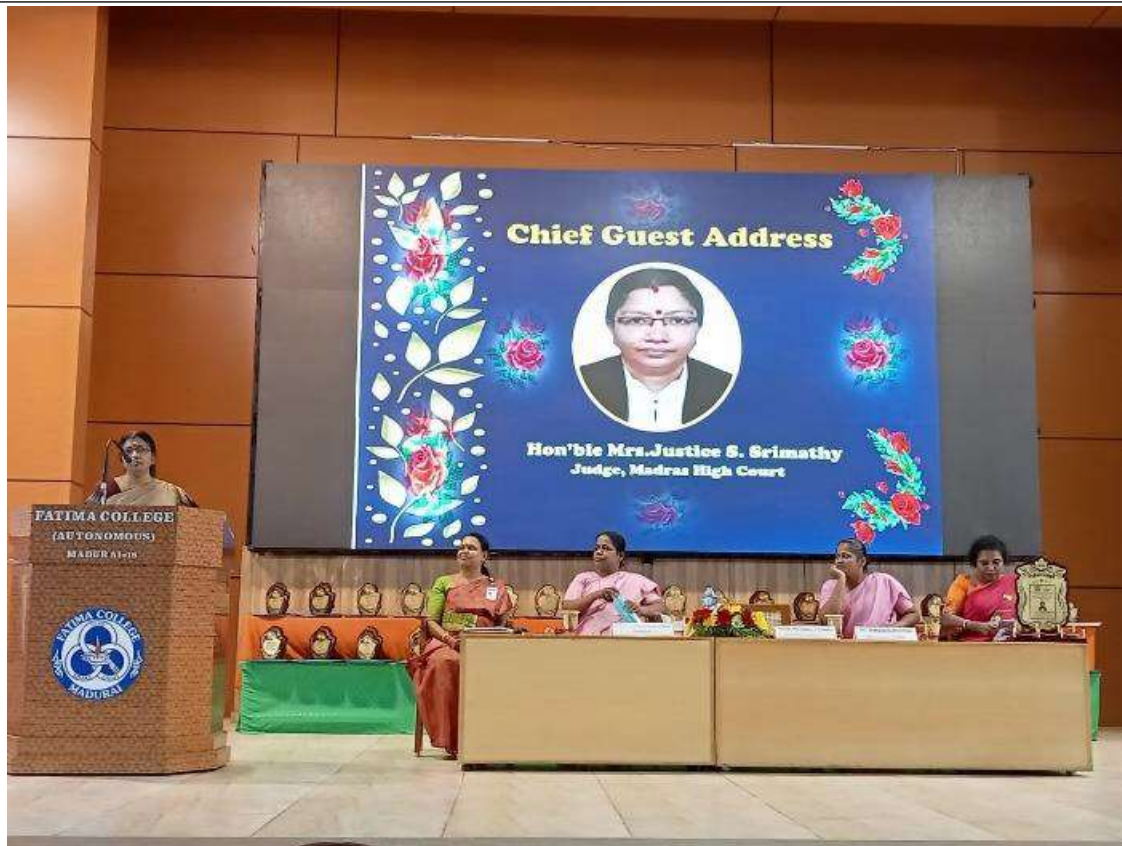
Chief Guest Address

Affiliated to Madurai Kamaraj University Re-Accredited with 'A++' by NAAC (Cycle - IV) Mary Land, Madurai - 625018, Tamil Nadu