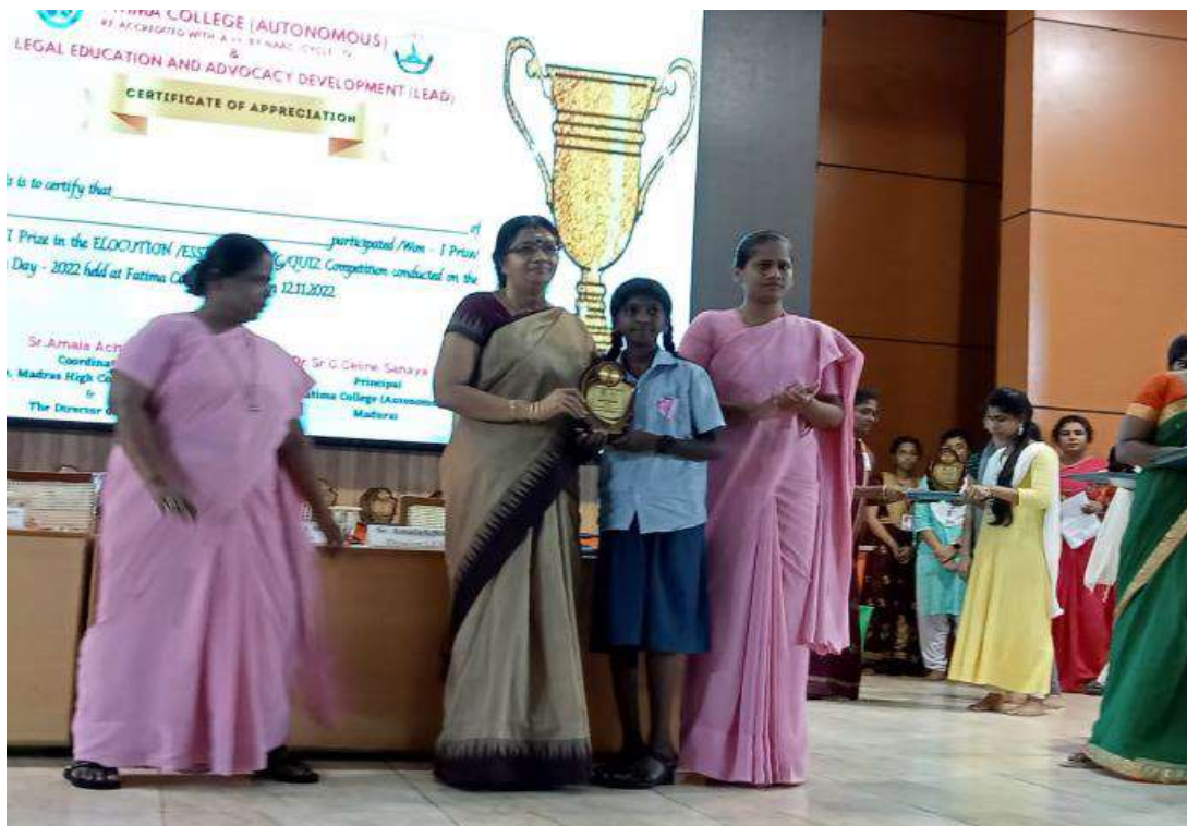
Distribution of Prizes