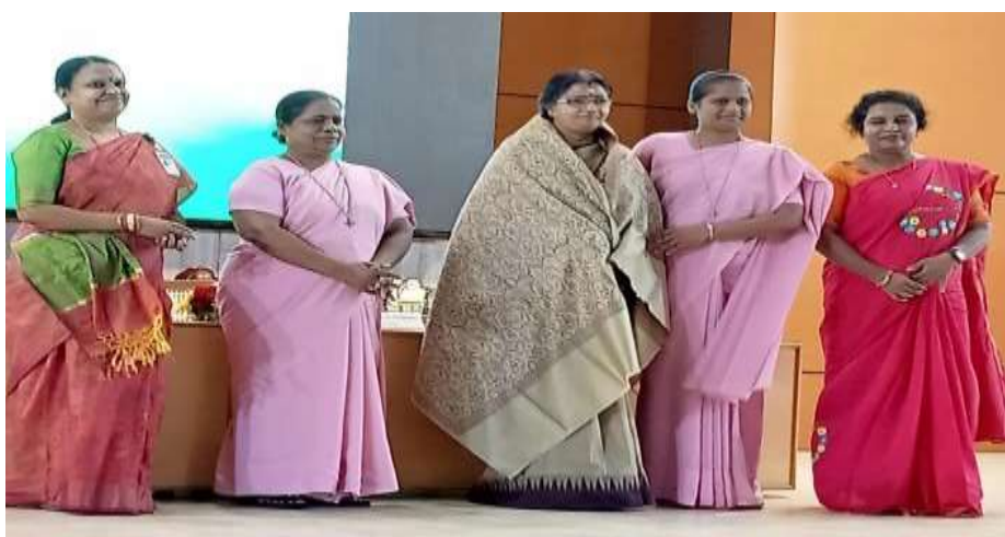
Honouring the Chief Guest