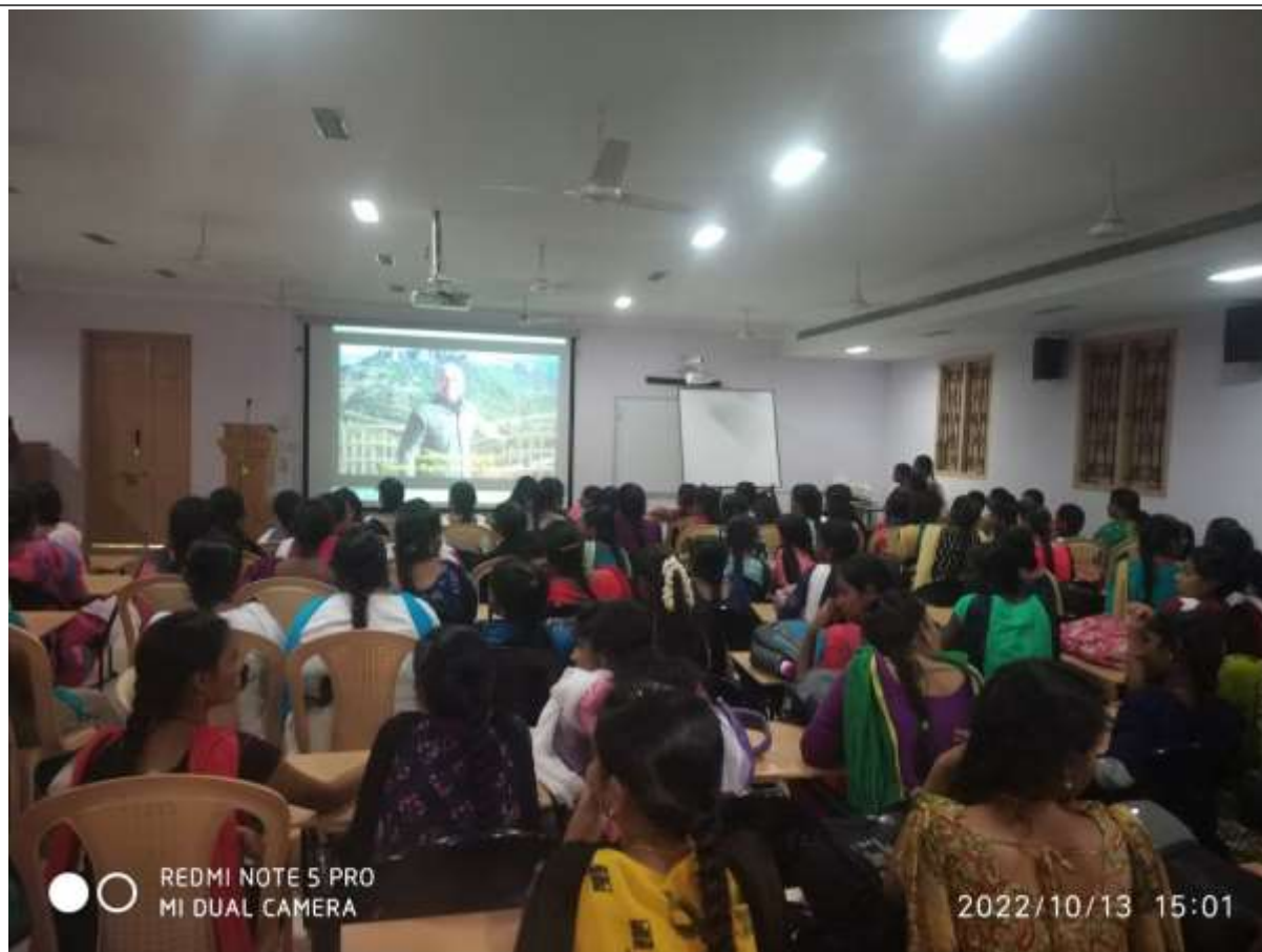
Students participation in videopresentation

Affiliated to Madurai Kamaraj University Re-Accredited with 'A++' (CGPA 3.61) by NAAC (Cycle - IV) Mary Land, Madurai - 625018, Tamil Nadu