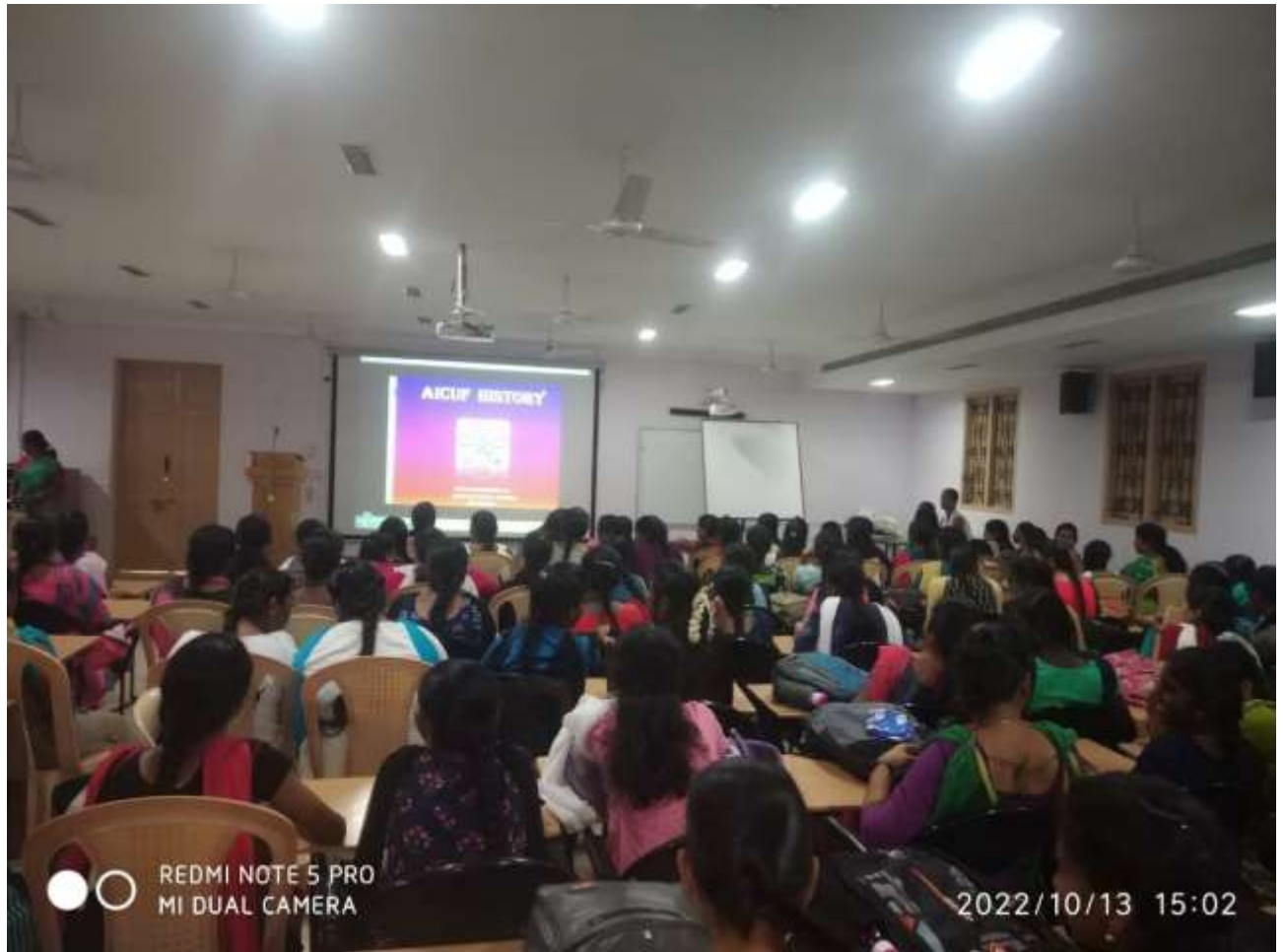
Students watching the History of AICUF