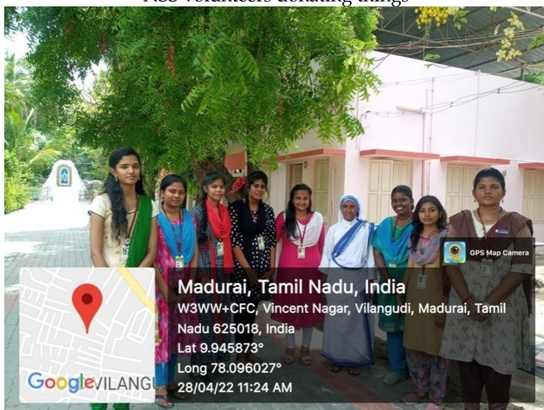
NSS Volunteers visiting the home