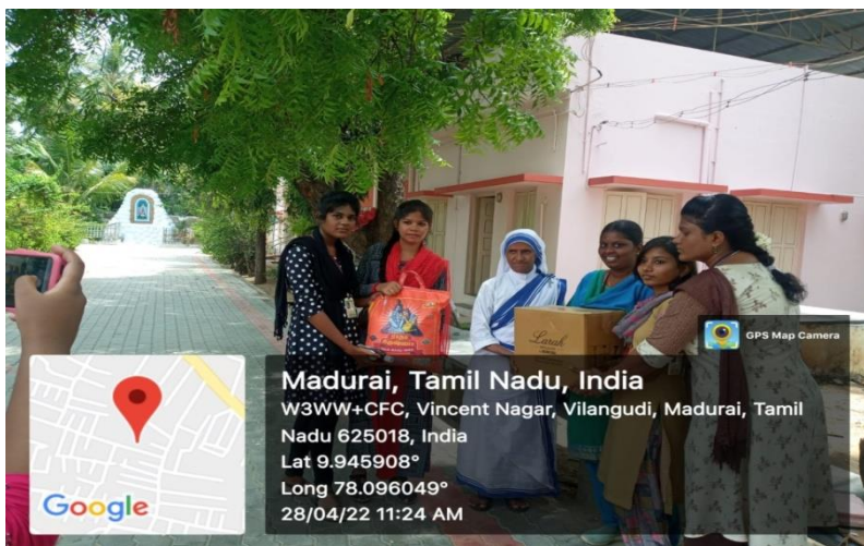
NSS volunteers donating things

Re-Accredited with 'A++' (CGPA 3.61) by NAAC (Cycle-IV) College with Potential for Excellence (2004-2019) 101-150 Rank Band in India Ranking 2021(NIRF) Mary Land, Madurai-625 018, Tamil Nadu