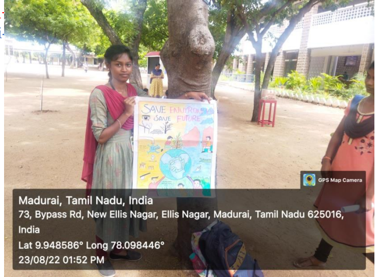
Students displaying posters