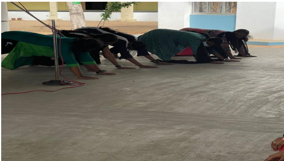
Yoga Training for the NSS Volunteers

Re-Accredited with 'A++' (CGPA 3.61) by NAAC (Cycle-IV) College with Potential for Excellence (2004-2019) 101-150 Rank Band in India Ranking 2021(NIRF) Mary Land, Madurai-625 018, Tamil Nadu