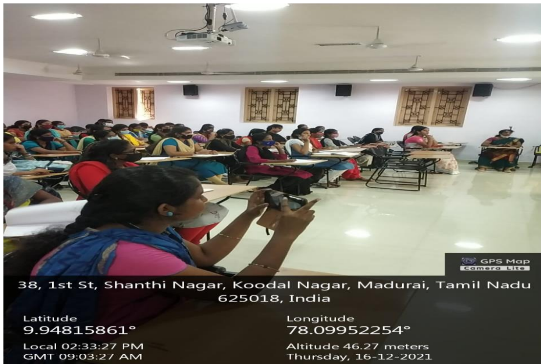
STUDENTS PARTICIPATION DURING THE CHIEF GUEST ADDRESS