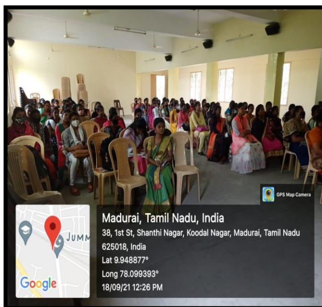
Students listening to the Guest Lecture