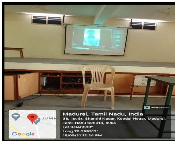
Resource Person presenting through Virtual Source

Affiliated to Madurai Kamaraj University Re-Accredited with 'A++' (CGPA 3.61) by NAAC (Cycle- IV) Mary Land, Madurai - 625 018, Tamil Nadu.