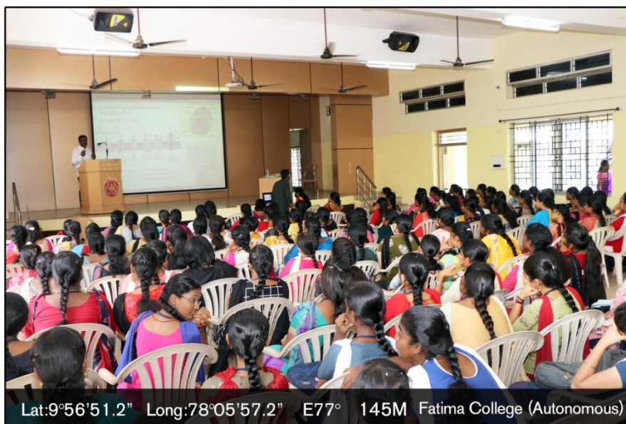
The students listening to the eye opening lecture on Biosensors