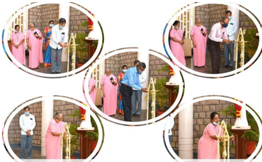
Lighting of the Lamp by the Peer Team Members of the Mock Visit