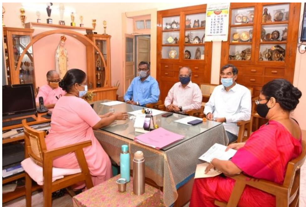
The Peer Team at the Principal's Office