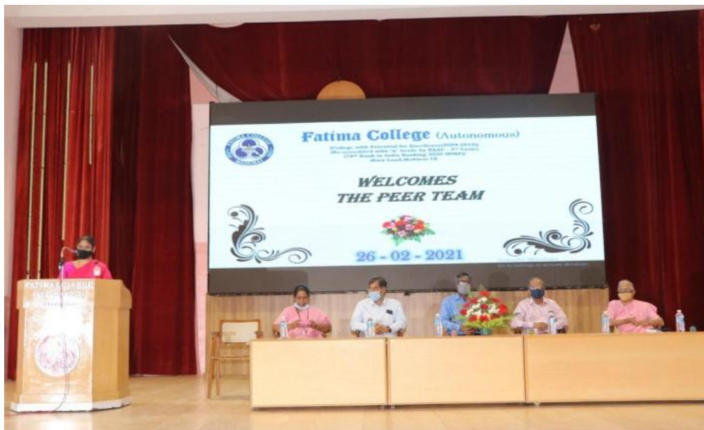
The IQAC Coordinator Explaining the Purpose of the Peer Team Visit