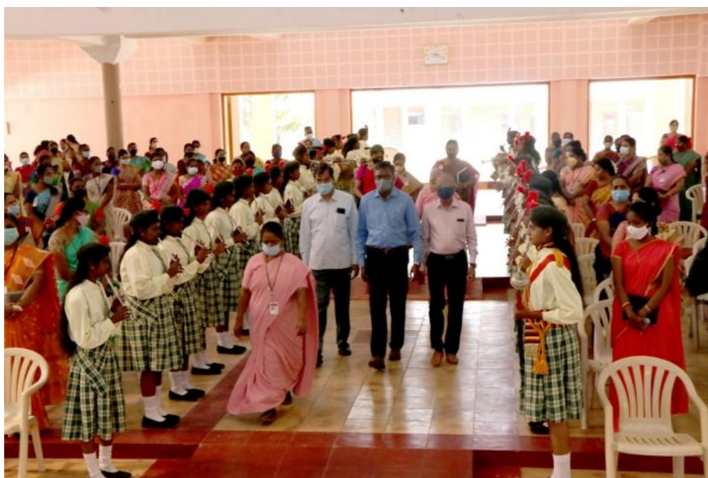
The Peer Team given a Rousing Welcome in Jubilee Hall