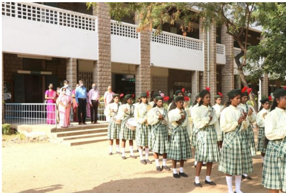
Fatima College Band Leading the Peer Team Members of the Mock Visit To Jubilee Hall