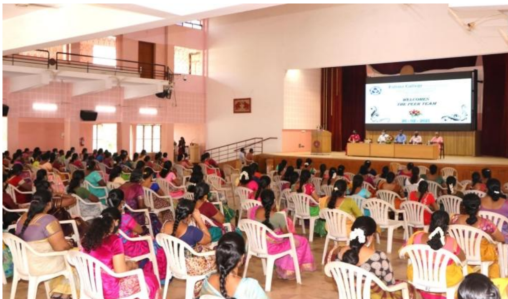
The Principal Welcoming and Introducing the Members