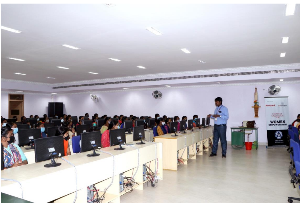
Glimpses of inauguration