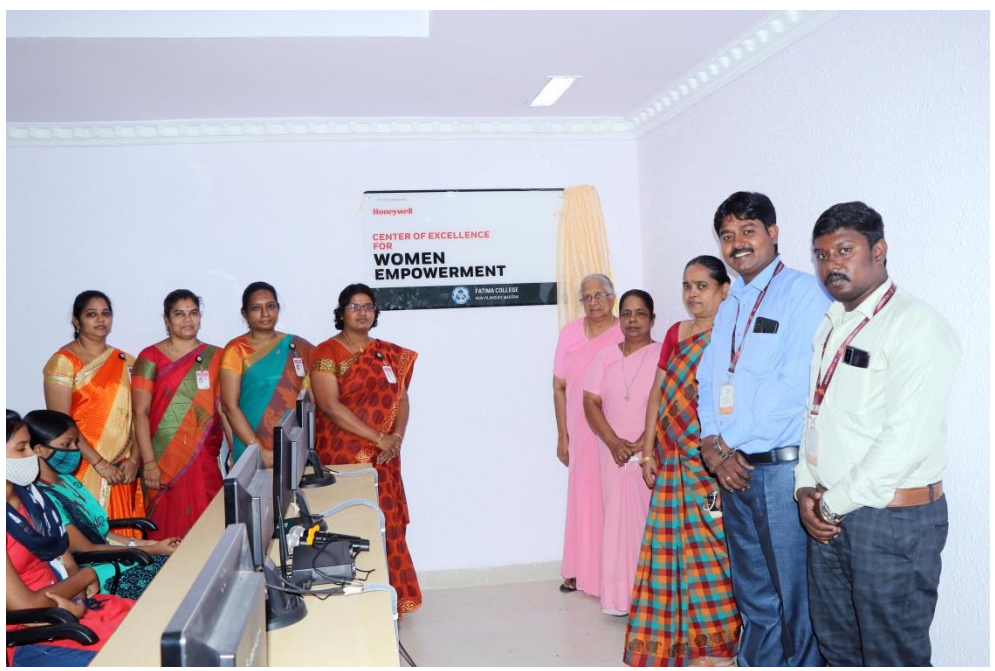
Glimpses of inauguration

Re-Accredited with 'A++' (CGPA 3.61) by NAAC (Cycle-IV) College with Potential for Excellence (2004 - 2019) Mary Land, Madurai - 625 018, Tamil Nadu.